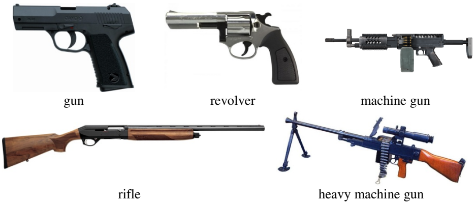
Fig. 5. Some visual examples of the weapon classes