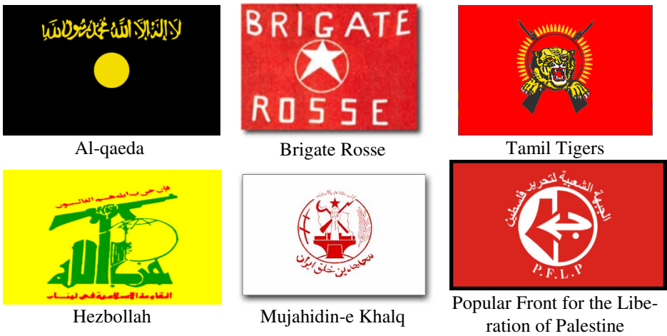
Fig. 6. Some visual examples of the logo classes