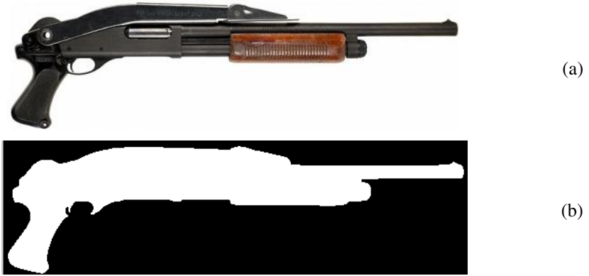
Fig. 4. Weapon Detection: input image (a), segmentation mask (b)