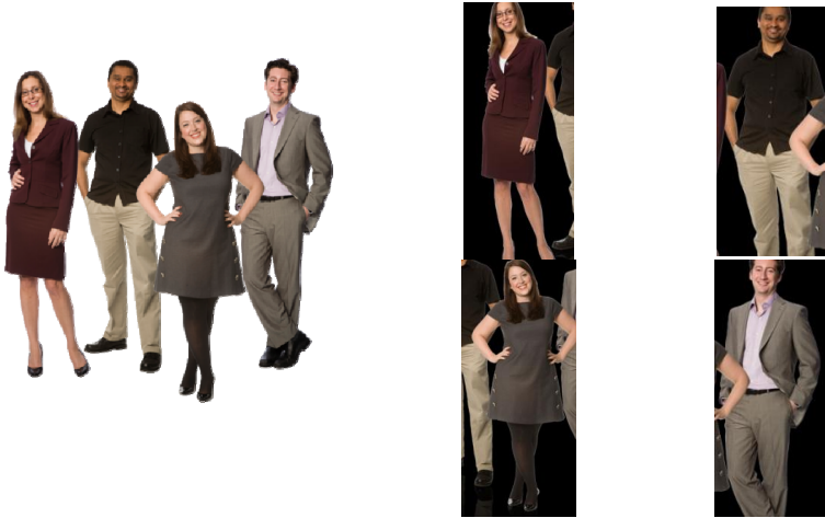
Fig. 2. A visual example of the results obtained with the implemented People Detection technique