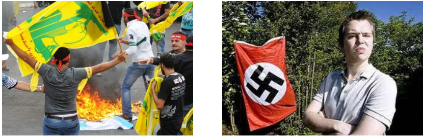
Fig. 7. Some case studies. Photos downloaded from the Web