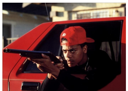
Figure 10: Boyz n the Hood (1991, dir. John Singleton). Lloyd Avery II (1969–2005) portrayed the shotgun-wielding member of Ferris's gang.

Retrial—Day 5—Part 1 [Dunn Testifies]"). Dunn imagined black people as legion—a resilient, formidable, vengeful, violent, monolithic unit perpetually on the hunt. (If ever the United States has suffered "car loads of people" terrorizing civilians after dark, we would have to look no further than to the notorious night rides of the Ku Klux Klan, whitecappers, and bald knobbers.) Given Dunn's embattled ego, it makes sense that he went about everyday life armed to face the worst. Based on the search warrants filed into the trial's discovery documents, detectives retrieved from Dunn's Jetta a handgun (legally owned with a concealed carry license), a magazine with eighteen live 9 mm rounds, a .22LR suppressor, three Stoney Point rifle pads, a gun tote, and a pair of nunchucks (Dunn Discovery Documents 2014, 83) (Figure 11).