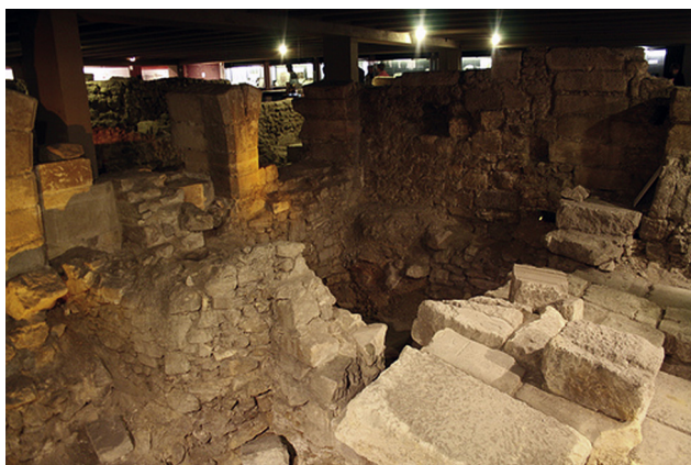
Fig. 1. Paris: archaeological crypt of Notre Dame.

sensitivity to light and their visibility. However, an outdoor archaeological site exposed to the sun and other environmental elements will probably suffer more damage when compared to an indoor site. Therefore, additional preventive measures must be taken into account for the outdoor site relative to its indoor counterpart since the former one has higher exposure to the elements. Colour temperature, colour rendering index, luminous intensity, luminous flux, illuminance/luminance, light exposure, quantity of ultraviolet radiation and luminous efficacy are the units, which inform us about the lighting characteristics [5]. Much of the variation in people's perception of whether light fading is a risk or not arises because this range of sensitivity is so dramatic – some colours in old objects that look fragile can indeed last many centuries, while some colours disappear within our own lifetime, or even in just a few years.