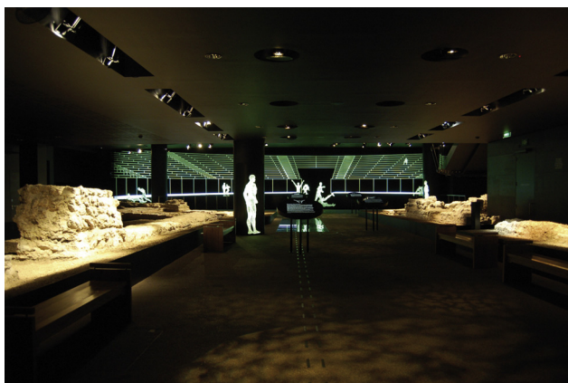
Fig. 3. London: lighting in London's Roman amphitheatre.

The roman amphitheatre of London was built in 70 AD. The display structure is about six meters under the square of the Guildhall Yard Art Gallery and the original wall is still visible along with the entrance from which gladiators, slaves and animals came into the arena. The presence of an advanced culture has archaeological, architectural and museographical implications. Therefore, the intervention strategy offered the possibility to conserve and properly show the original artifacts, including even a few of the original wooden fragments (Fig. 3). The intervention was conducted in 2004 by the London based firm Branson Coates Architecture. Their work concentrated on creating perspective effects, providing a remarkable charm for the visitor and recalling the dramatic and tragic atmosphere of gladiatorial games. The aim of the project was to study and reveal several aspects of Roman practices and traditions.