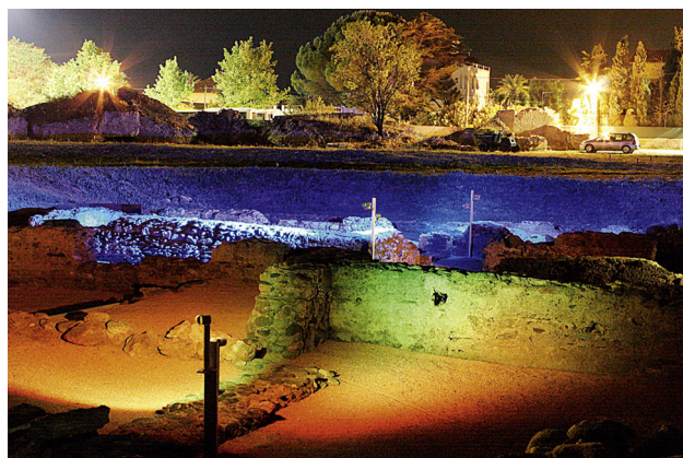
Fig. 2. Roses, Ciutadella: Roman and Greek Settlement ruins illuminated by LED equipment.

This case represents an example of good lighting practice in which light is used to serve different purposes such as showing different historical periods and building remains as well as indicating the location of Roman baths and highlighting some architectural