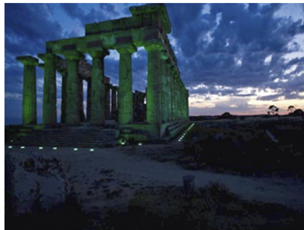
Fig. 4. Selinunte, Archaeological Park: Temple E.

This enabled a material and immaterial rebuilding of the environment, through the use of wireframe projections on the restored wall, with particular attention to the conservation and preservation of the original artifacts [8]. The shapes of gladiators, the stairs of the arena and the background of a cheering crowd recreate the magnitude of the amphitheatre. Lights and sounds do not distract the visitor, who is emotionally involved in the show. This intervention is an essential reference to show how projections can be employed as metaphors of an innovative restoration process involving the use of advanced technology.