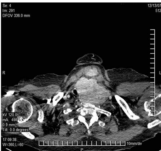
Fig. 2. Computed tomography scan. There is mediastinum involvement with tracheal stenosis and esophageal deviation due to the retrosternal goiter.

anesthesiologic consultations. The former clarified that there was indication to tracheostomy, and the latter remarked the absolute necessity to perform that kind of surgical maneuver, considering the impossibility to allocate an endotracheal tube with the same dimensions of the stenosis.