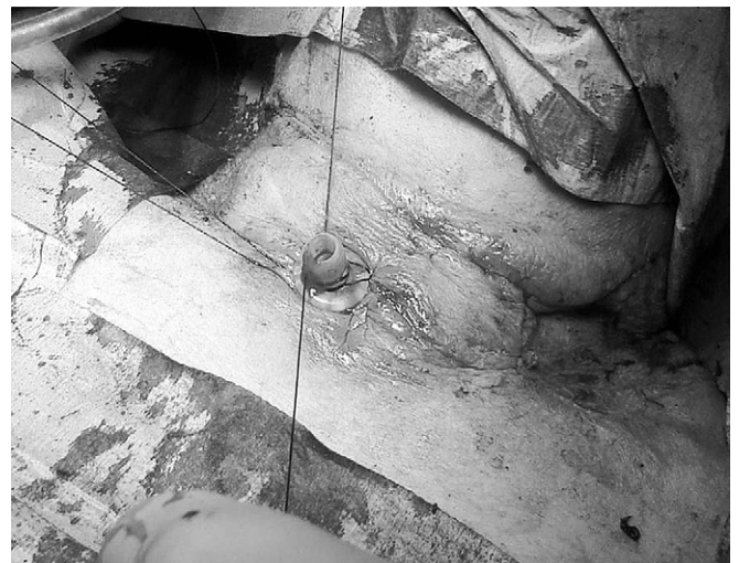
Fig. 3. Positioning of Montgomery's T-tube.

The complexity of the reported case was due to the long interval of time elapsed from the first operation and the final surgical resolution as well as because of the severe clinical symptomatology she experienced when she was first admitted to our clinic. The rapid worsening of the respiratory clinical picture associated with a sudden thyroid volume growth suggested the possibility of a highly malignant pathology, besides being supported by an imaging profile, which was only susceptible of a palliative treatment. A