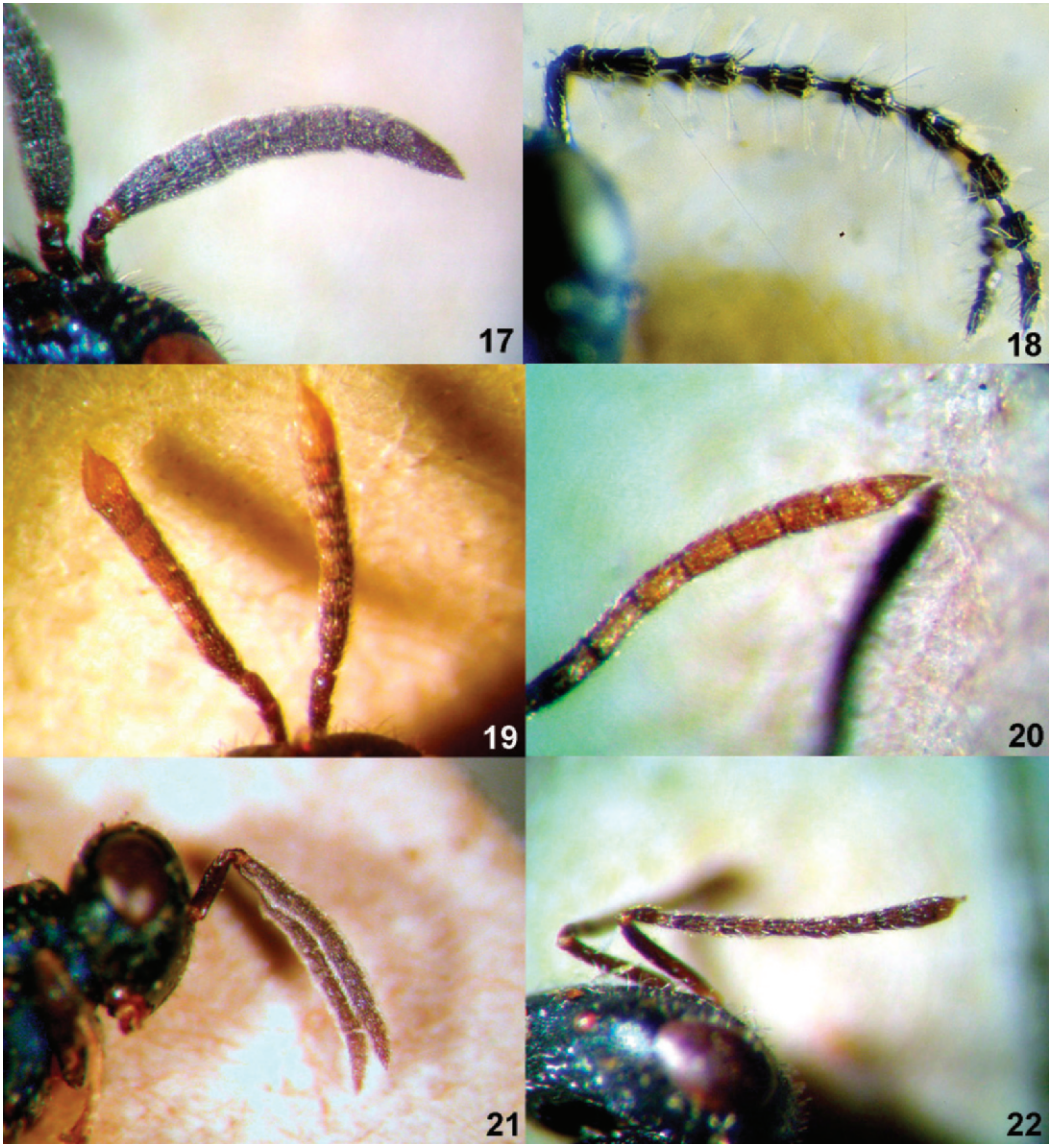
Figs 17–22. 17. N. cerasiops antenna ending without a clear spicula, ♂ syntype; 18. N. meridionalis antenna, ♂ paralectotype; 19. N. brevicornis antennae, ♀ holotype; 20. N. obscurus antenna ending with a spicula, ♀ paralectotype; 21. N. obscurus antennae, ♂ paralectotype; 22. N. meridionalis antenna with a two-segmented globose club, ♀ paralectotype.