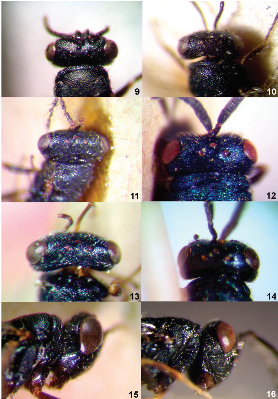
Figs 9–16. 9. N. scabriculus head in dorsal view, ♀; 10. N. globulariae head in dorsal view, ♀ holotype; 11. N. meridionalis head transverse in dorsal view, ♂ paralectotype; 12. N. cerasiops head in dorsal view, ♂ syntype; 13. N. meridionalis head transverse in dorsal view, ♀; 14. N. obscurus head in dorsal view, ♂ paralectotype; 15. N. obscurus gena with rounded lamina, ♀ paralectotype; 16. N. calabrus gena with quadrangular lamina, ♀ holotype.