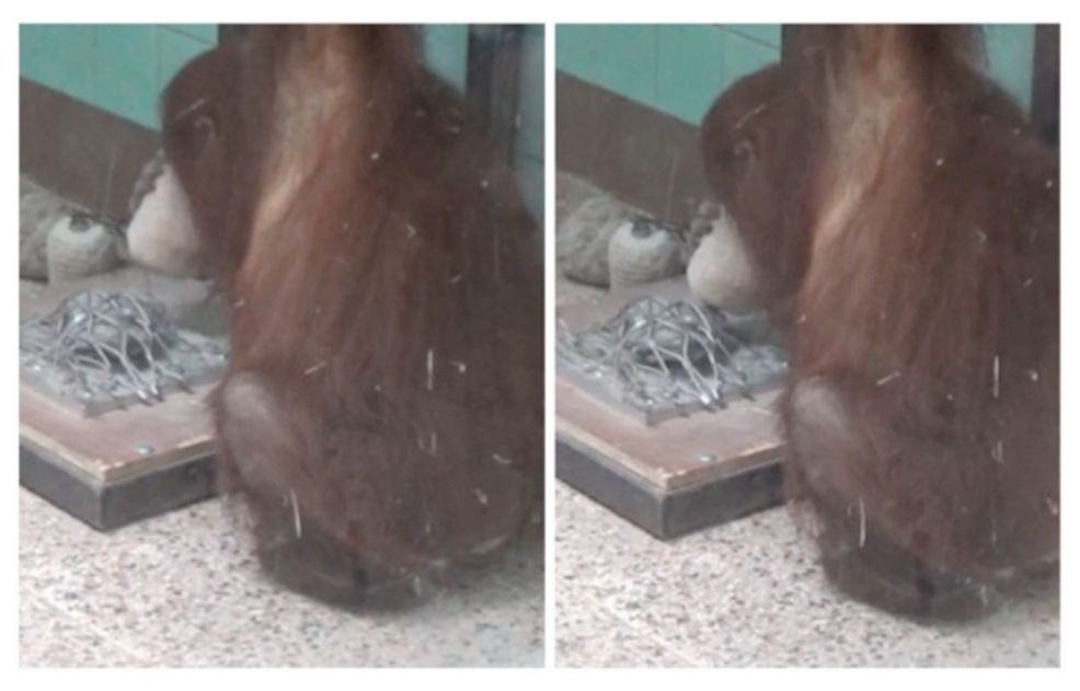
Fig 5. Lithic percussion. First percussive actions performed by Molly during trial one of the Social Production and Use condition using a hand-held hammer to strike the edge and exposed area of the core.

https://doi.org/10.1371/journal.pone.0263343.g005