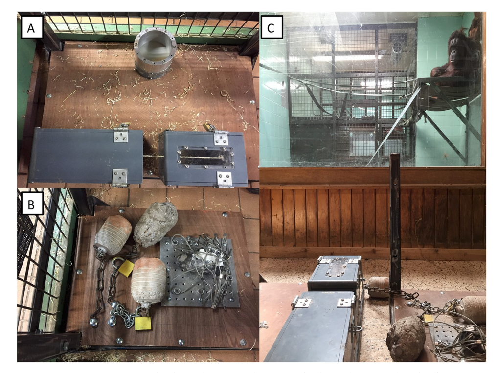
Fig 1. Experimental set up. Panel A depicts how the test boxes were fixed onto the wooden board and presented to the apes. Panel B depicts how the core and the three artificial hammers were fixed onto the wooden board and presented to the apes. Panel C depicts the room in which the demonstrations were given to the orangutans during cleaning routines.

Demonstrations. The demonstrations to the orangutans were performed from a room connected to the testing room via a glass wall and to the indoor enclosure via a wall of rigid metal mesh (Fig 1). When demonstrations took place during cleaning hours of the enclosures, the orangutans could observe the demonstrations from inside the testing room through the glass wall (Fig 1C). When demonstrations took place outside of cleaning hours, these were directed to the orangutans in the indoor enclosure that could observe the demonstrations through the metal mesh. During the demonstrations, the orangutans could be as close as 1 m from the testing apparatuses. An individual was considered to have observed a demonstration when his/her head had been oriented with eyes open towards the demonstrator during the