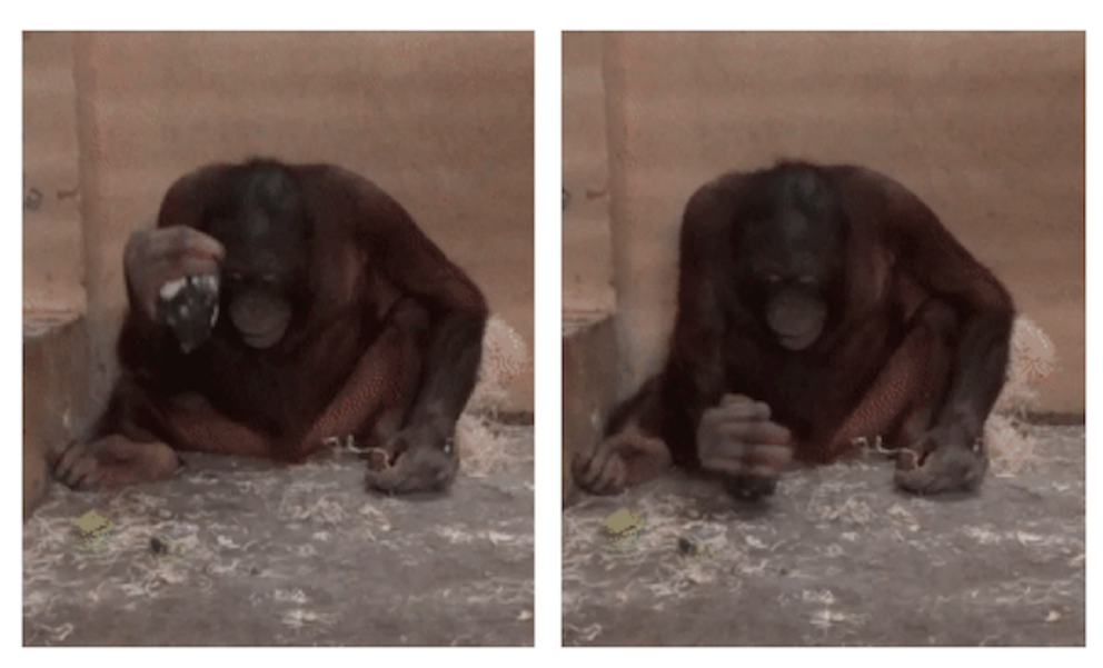
Fig 2. Spontaneous lithic percussion. Loui (the juvenile male orangutan) using the core as an active element to vertically strike on the concrete floor of the testing room during the Flake Trading condition of Experiment 2.

The orangutans at Twycross Zoo interacted with the materials 425 times. Of these interactions, 48 took place using the mouth and the rest were manual interactions. The frequency of the interactions during Experiment 3 (S4 Fig) was highest during trial one of the Social Production