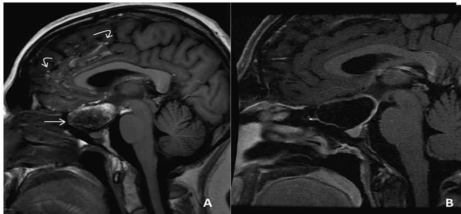
FIGURE 2: MRI sagittal views of the dermoid cyst (straight arrow) and subarachnoid sulcal cholesterol deposits (curved arrows) on non-contrast T1 (A) and fat-suppressed non-contrast T1 (B) sequences. Again, notice the deposits disappear on fat-suppressed sequencing.

She continued to have persistent headaches with migrainous features and continued cognitive complaints and paresthesias in the arms bilaterally. Her neurologic examination was normal, aside from attentional deficits. Postoperative imaging (Figure 3B, 3C) showed persistent abnormal signals in the subarachnoid space consistent with lipid particles. Her spinal cord imaging did not show any subarachnoid dermoid cyst components irritating radicular nerves as the etiology of her paresthesias. Although she refused a lumbar puncture, her headaches were attributed to persistent chemical meningitis based on clinical and imaging findings. She was managed symptomatically for headaches and paresthesias with an acceptable response.