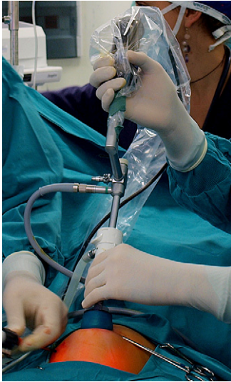
Fig. 1. View of operative laparoscope, 23 cm long.

When necessary, hemostasis was achieved by applying the bipolar forceps on the ovarian parenchyma after excision of the cystic wall. An uninterrupted suture was placed on the edge of the residual ovarian parenchyma. The cyst walls were sent for routine histologic examination.