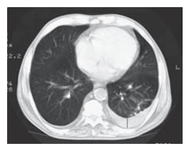
Figure 2. Axial section through thoracic outlet scans shows left dorsal pleural effusion with no pleural neither pulmonary mass.