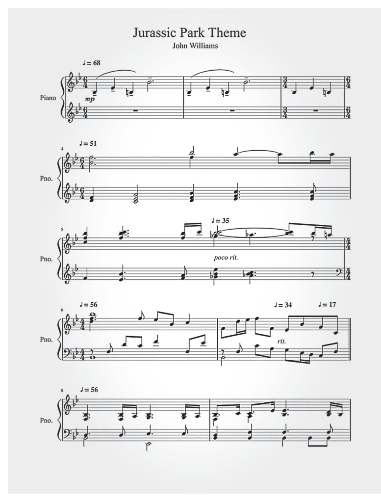
Fig. 4. John Williams's music for Jurassic Park (1993, directed by Steven Spielberg). The cue "Theme from Jurassic Park", track 2 on the original album (fair use)

the original album presentation was retained and only four tracks were added as bonus tracks at the end (Geffen Records).<sup>5</sup> On the other hand, it is only with the release of La La Land Records (LLLCD 1409) that it becomes clear that in the film a different version was actually used for