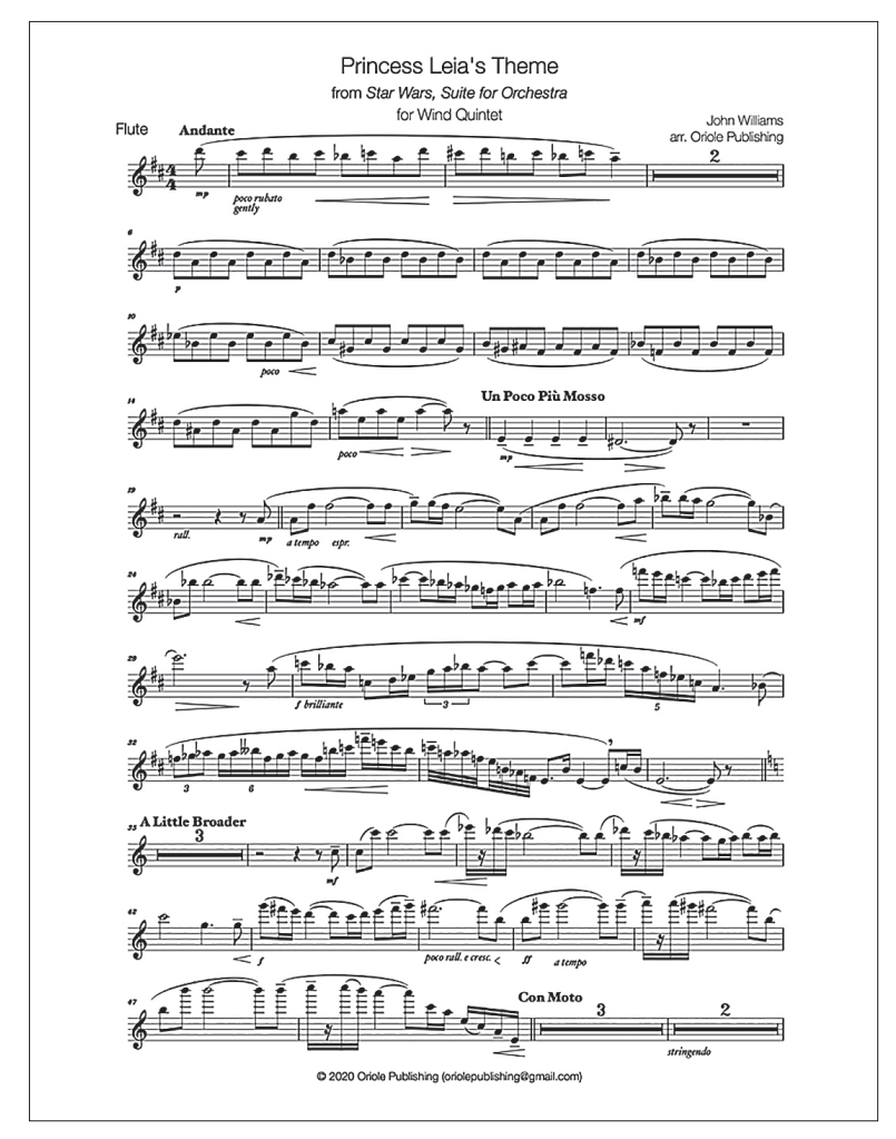
Fig. 5. John Williams, a part of "Princess Leia's Theme", from Star Wars (directed by George Lucas, 1977); Suite for orchestra for Wind Quintet (fair use)