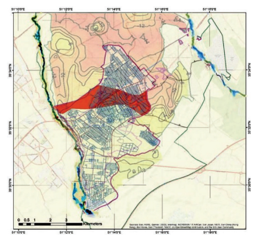
Figure 3 Adaptation of fault layers, subsidence and flooding in Islamshahr city

According to the fault and subsidence conditions in the study area, the vulnerability of water and electricity network, sewage and surface water, transportation network and current status uses with the risks of these indicators and adaptation and hazard map produced in the city. These studies show that most of the urban areas in areas 2 and 1 are located between two active faults. In this area, a large number of residential uses, several service departments, the governor's office, two municipal areas, four fuel stations, The main hospital of the city, the three main drinking water reservoirs and the areas where the city is being developed in the current development.