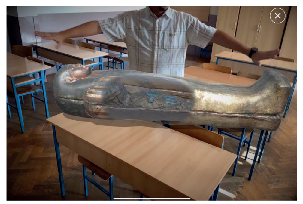
Figure 1. X-raying a sarcophagus in a classroom with the CivilisationAR app.

There is a short yet concise overview given by VirtualiTeach<sup>1</sup> on how to bring history easily into the classrooms by using augmented reality.