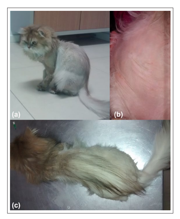
Figure 1 (a) Emaciation, muscle loss, unkept haircoat and alopecia. (b) Fragile thin inelastic skin. (c) Bilateral symmetrical alopecia, unkempt haircoat, and potbellied abdomen

hyperadrenocorticism (HAC). Blood work and urine analysis results are shown in Table 1. A serum fructosamine concentration suggested good control (369 µmol/l; reference interval [RI] for good diabetic control established by the employed laboratory 350-400 µmol/l). However, given the persistence of clinical signs and the results of serial blood glucose evaluation (Table 1, Figure 2), the glargine dose was increased to 4 U q12h SC. One week later, a low-dose dexamethasone suppression test (LDDST; using 0.1 mg/kg dexamethasone IV) was conducted, the results of which proved compatible with pituitary-dependent HAC (PDH): basal cortisol 143.7 nmol/l (RI 10-138 nmol/l), 4 h post-dexamethasone 64.6 nmol/l and 8 h post-dexamethasone 49.4 nmol/l (normal response <38 nmol/l). Additionally, bilateral adrenomegaly was present on abdominal ultrasonography (US), further supporting this diagnosis (Figure 3). The liver appeared a little heterogeneous on US, whereas the gall bladder showed thickened walls (0.25 cm), suggesting cholecystitis.