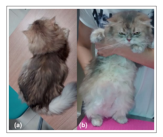
Figure 4 (a) Weight and muscle mass gain, complete haircoat re-growth and re-pigmentation. (b) Loss of potbellied appearance and ventral abdominal haircoat re-growth

months of trilostane treatment emphasizes the need for careful monitoring of insulin-treated diabetic cats with underlying HAC treated with trilostane, as iatrogenic hypoglycemia can pose a danger if the onset of remission is missed. Indeed, in the current case, it would have been indicated to have checked the cat's glucose concentrations more frequently and/or for the owner to have conducted more intense monitoring at home (home blood glucose or urine glucose monitoring); unfortunately, this was not possible for the owner in question. Moreover, this cat might have been able to stop insulin even earlier, once normal fructosamine values and absence of glycosuria were detected at some time points before insulin withdrawal.