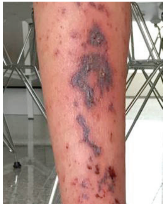
Figure 1. Necrotic lesions on the right pretibial region.

The patient also reported the onset of hypoesthesia of the first three digits of the left hand associated