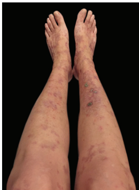
Figure 4. Improvement of the skin lesions after a single infusion of IVIg (2 g/kg).

The treatment of LCV depends on two major factors: the etiology and the extent of disease, especially in the cases of a systemic involvement. When LCV is the manifestation of a systemic vasculitis process, the