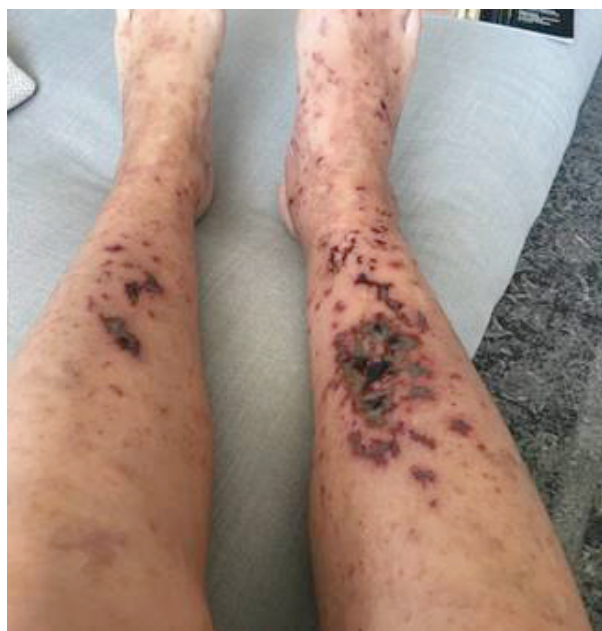
Figure 3. Necrotic hemorrhagic evolution of the lesions of lower limbs.

with stiffness and tremor. She also reported hypoesthesia on the lateral side of the left ankle and foot, as well as widespread arthromyalgias. Thus, electromyography and electroneurography (EMG/ENG) of the upper and lower limbs was performed, but resulted negative.