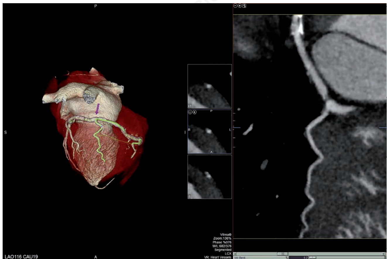
Figure 1. VRT reformation showing severe stenosis of the tract PL-CX (arrow).

Several classifications of coronary anomalies are present in literature and the most suitable for SCA detected by MDCT was proposed by Lipton et al. [5,7], according to location of the ostium, anatomical distribution, course of the transverse trunk.