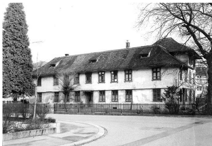
Main building of the «Laboratorium» in 1960