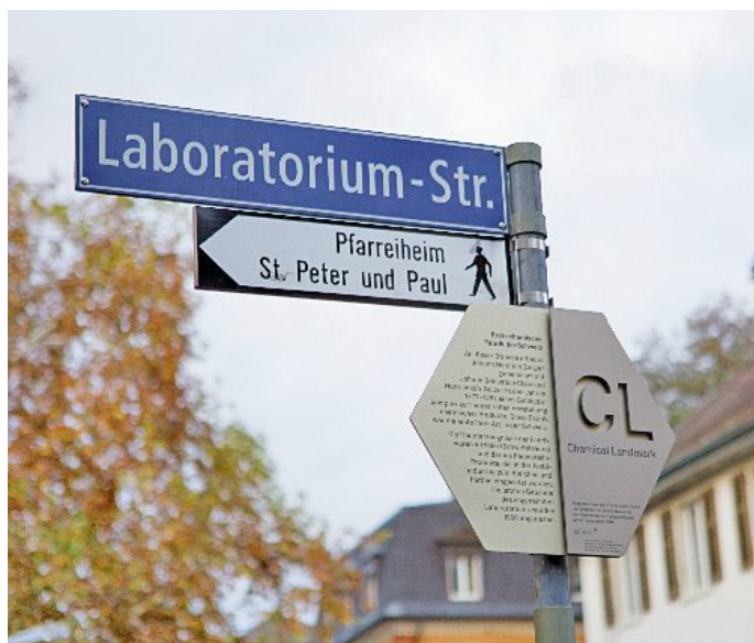
Commemorative plaque at its final place at the Laboratoriums-Strasse

More information about the 2009 'Chemical Landmark' designation may be found at www.chemistry.scnat.ch/Chemical_Landmark_2009 .