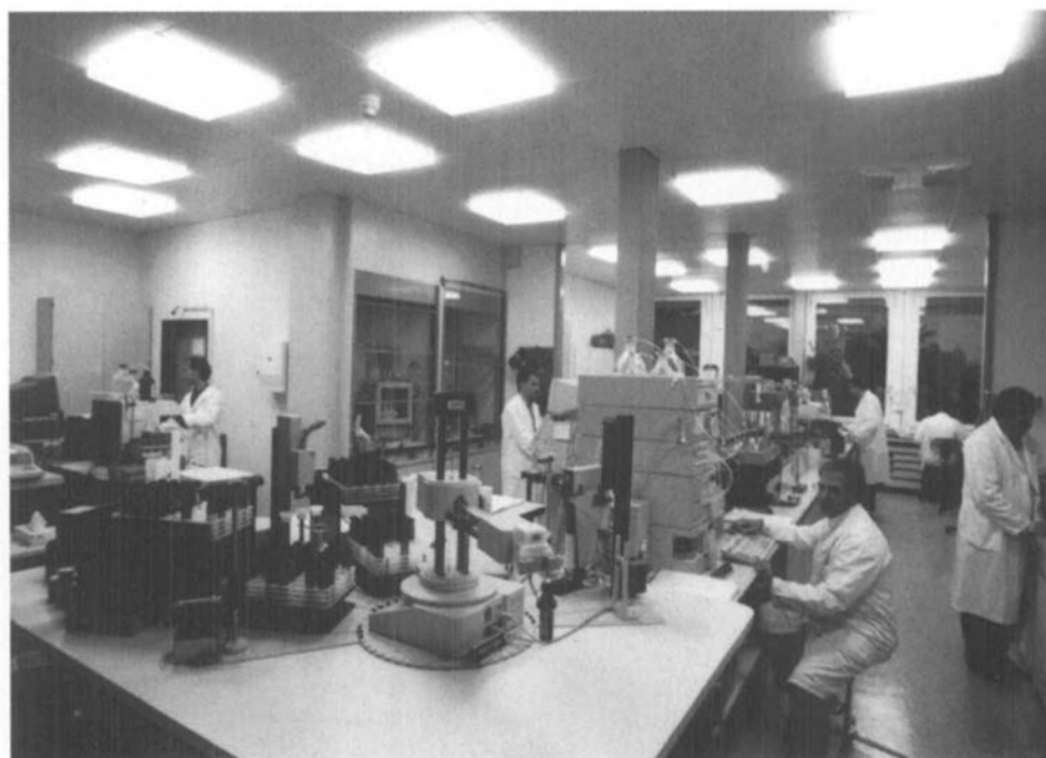
Figure. Automation in the control lab for finished products with a robot in the foreground

During the early 70s the production was discontinued due to the growth of residential zones around the factory. As part of the basic reorganisation the firm came under the direct control of the quality assurance department of Sandoz Ltd. , Basel. The company was transformed into