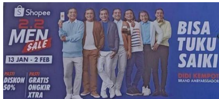
Figure 2. Shopee Advertisement Brand Ambassador Didi Kempot

Based on the ads from the brand ambassador didit kempot, this ad is quite interesting to visit and quite persuasive. Thus it can be concluded that Shopee ads already serve to communicate customer value persuasively so as to create the use and interest in re-buying a service [17] [18]. Shopee ads can be said to be quite successful in the actions of buyers, who have met the criteria of AIDA Attention (containing attractiveness), Interest (containing attention and interest), Desire (giving rise to the desire to try), Action (leading to action to buy). The high number of visits and traffic from web shopee, may also be influenced by advertisements circulating on social media.