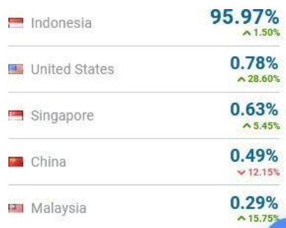
Figure 4.5 traffic to Shopee by Country

Shopee not only manages advertising strategies through social media but also through Ad networkd which is dominated by ads through the Google Display Network.