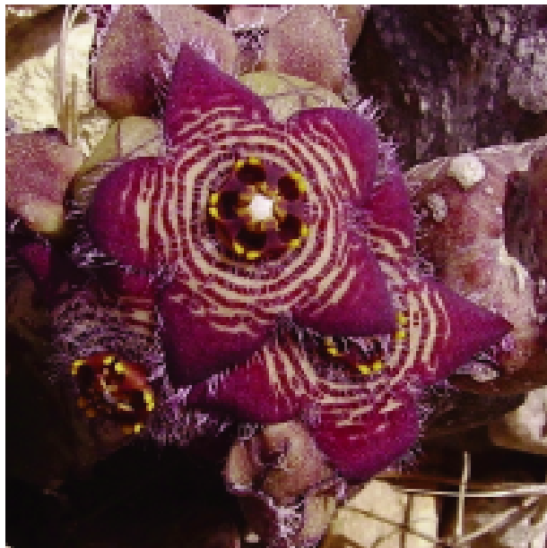
Fig. 5 — Flowers of C. europaea (Photo: P. Zito).

est ones look greyish. It forms large clumps up to 15-20 cm in diameter. Flowers are red-brown with yellow stripes or streaks, 10-15 mm in diameter. The corona is normally purplish (Fig. 5) (SAJEVA & COSTANZO, 1994). Fruits are follicles that at maturity dry out. Plants growing in rock crevices usually have a central erect stem and many smaller ones more or less procumbent, while