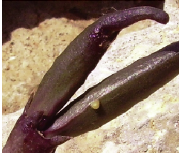
Fig. 4 — Egg of D. chrysippus on the follicle of C. europaea photographed in the field.

est ones look greyish. It forms large clumps up to 15-20 cm in diameter. Flowers are red-brown with yellow stripes or streaks, 10-15 mm in diameter. The corona is normally purplish (Fig. 5) (SAJEVA & COSTANZO, 1994). Fruits are follicles that at maturity dry out. Plants growing in rock crevices usually have a central erect stem and many smaller ones more or less procumbent, while