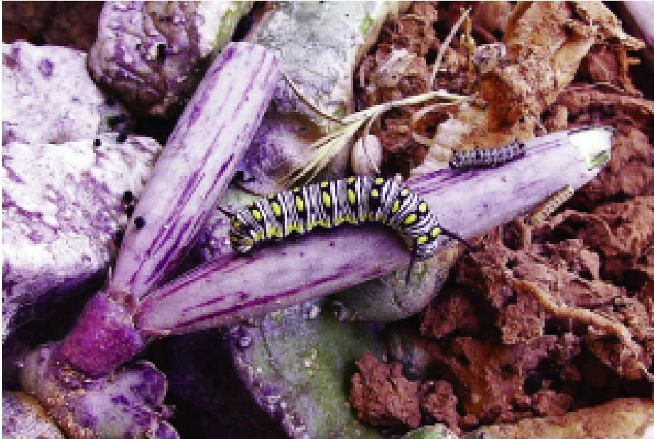
Fig. 8 — Caterpillars of D. chrysippus feeding on follicles of C. europaea . (Photo taken in laboratory: P. Zito).

Plumbaginaceae. Among Asclepiadaceae the following taxa have been reported as host plants for larvae of D. chrysippus : Asclepias , Aspidoglossum , Brachystelma , Calotropis , Caralluma , Ceropegia , Cynanchum , Gomphocarpus , Huernia , Ischnostemma , Kanabia , Leichardtia , Leptadenia , Marsdenia , Metaplexis , Pachycarpus , Pentarrhinum , Pentatropis , Pergularia , Periploca , Pleurostelma , Raphistemma , Rhyncharrhena , Sarcostemma , Schizoglossum , Secamone , Stapelia , Stathmostelma , Tylophora (ACKERY & VANE-WRIGHT, 1984; VANE-WRIGHT & DE JONG, 2003). Within the genus Caralluma , only C. burchardii (BRANDES, 2005) has been recorded at specific level as forage plant for D. chrysippus . Our record is the first for the species C. europaea as fodder for D. chrysippus .