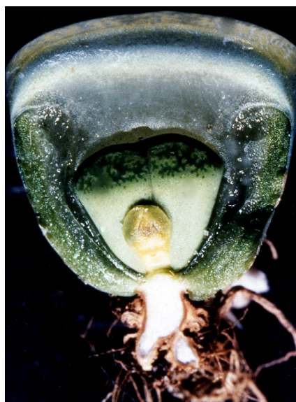
Fig. 1 A Lithops plant in which one old leaf was removed, showing the other old one, the new developing leaves and the flower bud. The short stem connects the leaves to the root system.

The genus Lithops (Aizoaceae) includes 37 species, several subspecies and various cultivars (Cole and Cole 2005). It is distributed in western and central areas of southern Africa, mainly Namibia and South Africa, and only marginally in the south-eastern border of Botswana. Lithops species grow in open rocky soils, with annual rainfall ranging between 100 and 500 mm. Lithops are succulent plants in which stems are virtually absent and leaves and roots are the only evident organs. Succulence evolved in several families as an adaptation to an arid environment and water storage tissues may be present in different organs, such as stems (e.g. Cactaceae), roots (e.g. Apocynaceae and Cactaceae) or