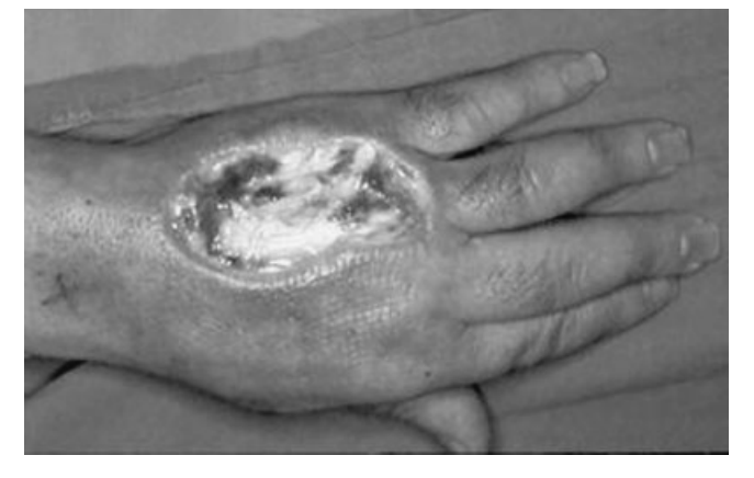
Fig. 1. Necrosis 14 days after untreated epirubicin extravasation on the dorsum of the hand of a 65-year-old man.

4. Neutral: neither inflammatory nor irritating.