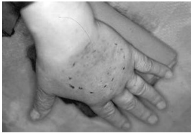
Fig. 6. Immediate post-op.