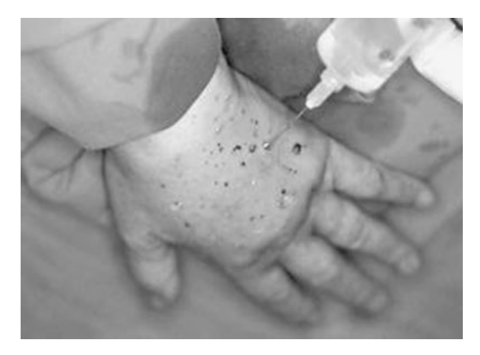
Fig. 5. Saline flush-out of the extravasation site.

Extravasations of antiblastic chemotherapeutic drugs are fortuitous and unpredictable events. Of course, there are various more or less invasive treatments to choose