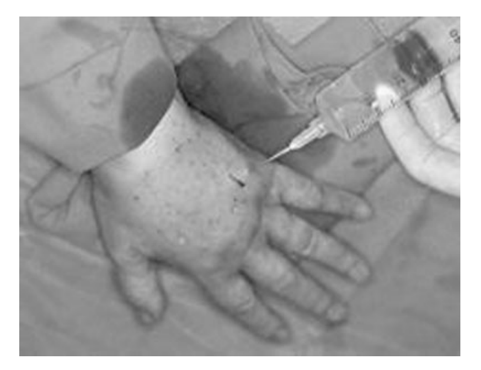
Fig. 2. Infiltration of hyaluronidase and physiological solution.

The skin holes are never sutured (Fig. 6); they are just medicated with antibiotic cream and vaselined gauze. Soft, compressive bandage will then favor further liquid drainage by means of imbibition and capillarity.