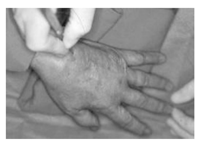
Fig. 3. A 62-year-old woman suffering from doxorubicin extravasation. The skin holes were done by means of a no. 11 scalpel.

We just carry out hyaluronidase infiltration on patients who come to us after 48 hr with oedemas or inflammation or a flush. By contrast, when no clear clinical signs are present, we do not carry out any treatment but we see the patient every day for the first week.