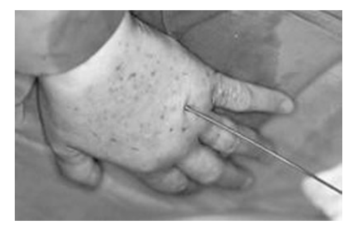
Fig. 4. Tunnelling by means of a 2 mm cannula. Aspiration of the injected liquid.