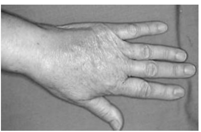
Fig. 7. Result after 1 month.