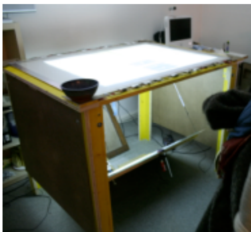
Figure 1. cueTable from inside and outside.

In this paper we present cueTable—a cooperative multi-touch interactive tabletop we developed as a base technology to explore new interaction concepts for cooperative multi-touch applications (Figure 1 shows the cueTable with the front side open to give an impression of the inside). We explain how to build a cooperative multi-touch interactive tabletop with standard and low-budget hardware and little implementation effort. We share technical information on the hardware and software setup as well as on a game application for the tabletop. And we report on user feedback to the tabletop and the applications. Finally, we report on related work, and draw conclusions.