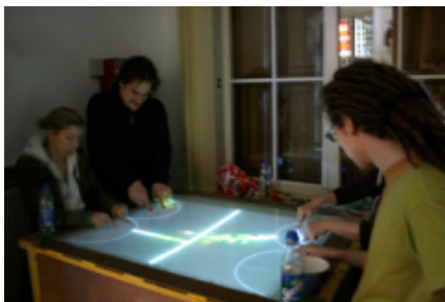
Figure 3. cueTable, Puh game, and four users.

In order to test the cueTable and to get user feedback in a cooperative multi-touch scenario we developed a Puh game application that is very similar to Atari's Pong game. In the Puh game two teams consisting of two players each play against each other. They use a paddle to shoot a ball from their own side of the table to the other side of the table. If the team succeeds in moving the paddle to the place where the ball comes to their side of the table, the ball bounces back to the other side and the game continues. If the team fails to do so and the ball hits the edge of the own side of the table, the other team scores a point and a new ball comes in from the centre.