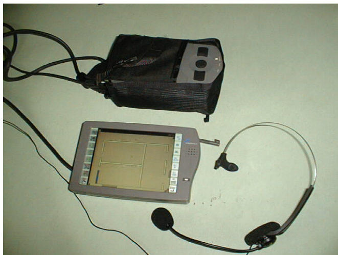
Figure 1, Wearable Computer Xybernaut MA - IV

This paper discusses a preliminary design of a wearable computer for supporting progress monitoring.