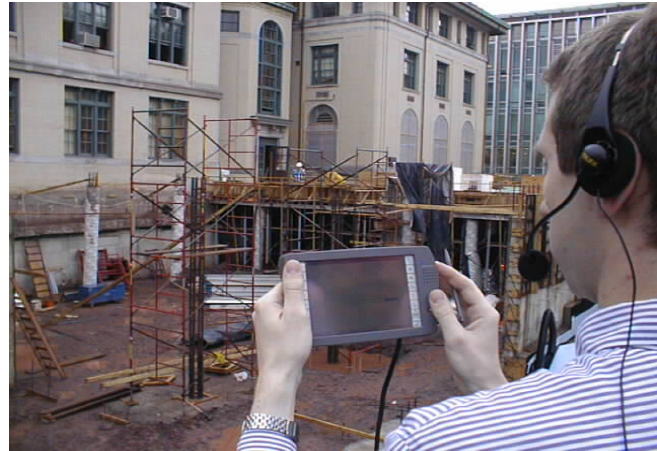
Figure 4, Input of progress data on site

To support the process of identifying an element and navigating to it, ICMMS has a zoom and a scroll function that can be controlled via speech input and via the touch screen. Upon clicking with the stylus on the background of the drawing, a dialog box appears that has the 2 buttons to zoom in and zoom out on a drawing. Scroll functionality is provided by the scroll bars of the drawing. It is important for the ease of use of the system to access scroll and zoom functions quickly. The limited size of the screen of the wearable computer makes it necessary to take special care of the accessibility of all elements, whatever scale they are, in a drawing.