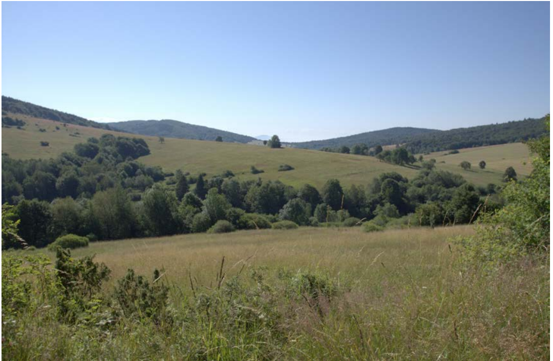
Fig. 1. Typical landscape of the Beskid Niski Mts – view of Ciechania village in Magurski National Park.

built of Carpathian flysch (Fig. 1). Altitude ranges mainly from 650 to 700 m a.s.l., reaching maximum of 847 m at the summit of Magura Wątkowska Mt. The park covers 19,439 ha of the Wisłoka River valley, including its upper reaches and origin. MNP is located in a pass in the Carpathians where two