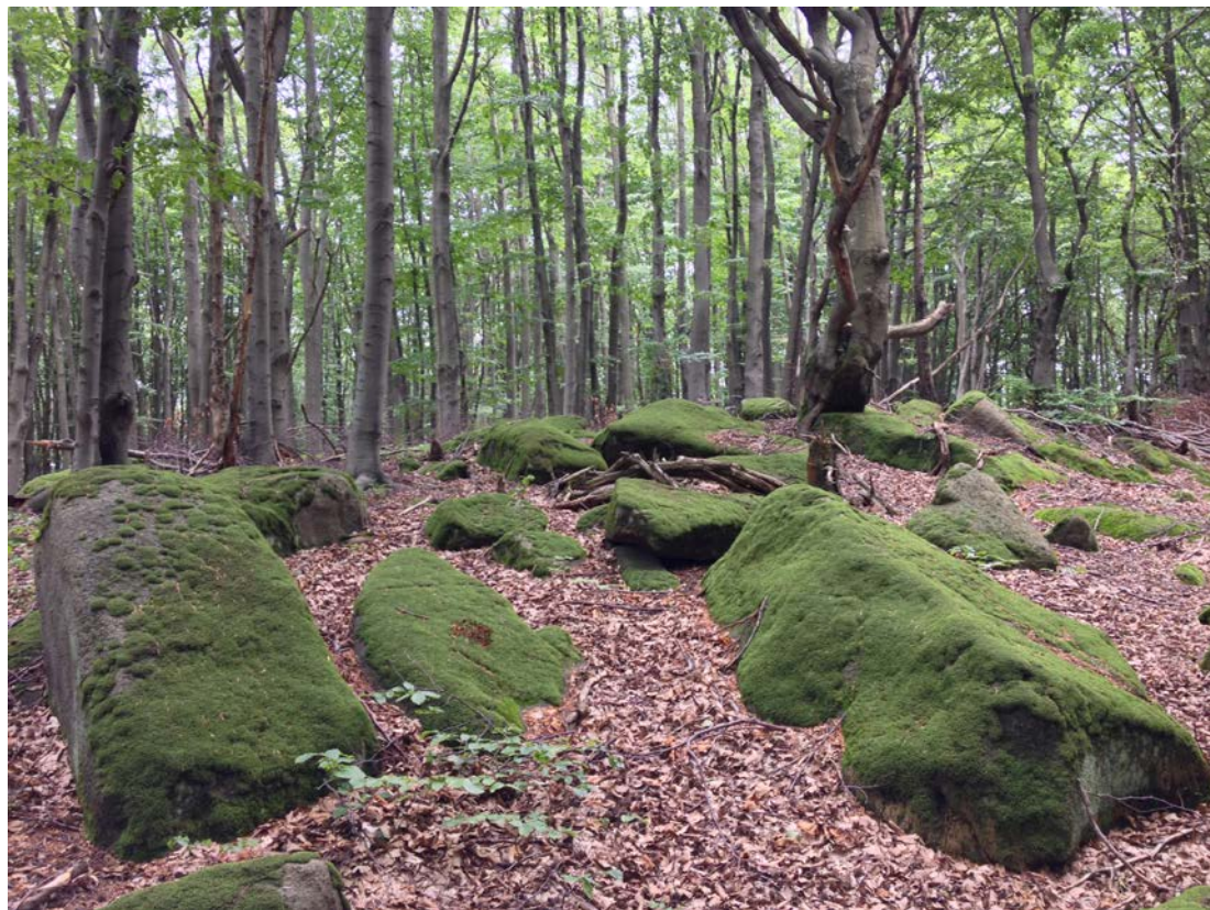
Fig. 2. Dentario glandulosae-Fagetum – dominant forest association in Magurski National Park.

main ecological corridors intersect: north-south and east-west. The park is a typical woodland (90% wooded area) with relatively well-preserved vegetation. The most frequent forest community is Dentario glandulosae-Fagetum , which creates the characteristic landscape of the park (Fig. 2). Sycamore woods, rare in the Polish Carpathians, are represented by three associations: Sorbo-Aceretum , which occurs only on the peak rocks on Kamień Mt., Phyllitido-Aceretum , occurring on Magura Wątkowska Mt., Kamień Mt. and Suchania Mt., as well as Lunario-Aceretum developed in several patches. In the foothills there are mainly planted and managed stands dominated by pine, as well as multi-species riparian forests, and rarely hornbeam woods. Non-forest vegetation is represented by varied meadow and grassland communities, and also peat-bogs. Biocenoses in MNP having