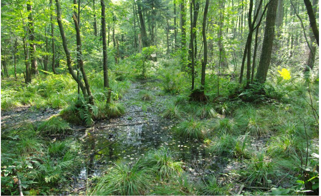
Fig. 4. Collecting site no. 17 with Ribesio nigri-Alnetum plant community – the site of Absconditella pauxilla Vězda & Vivant.

forest section no. 152a, 49°29'41.28"N, 21°25'54.27"E, alt. 550 m, shady Dentario glandulosae-Fagetum .