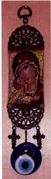
8. The traditional nazar boncuğu set into Christian imagery and sold as a tourist souvenir, Istanbul, Turkey. Author: Elżbieta Wiącek

Source: [on line] http://en.wikipedia.org/wiki/Nazar_%28amulet%29#mediaviewer/File:Nazar_boncu%C4%9Fu_tailfin.jpg , December 2, 2015