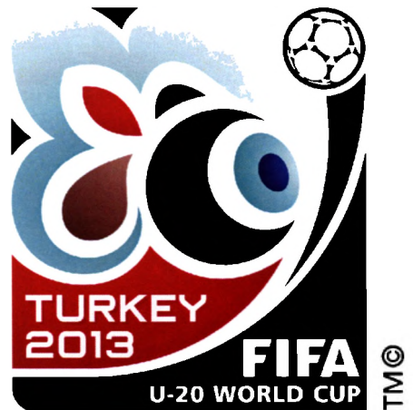
9. Logo of the 2013 FIFA U-20 World Cup.