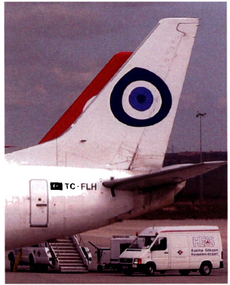
7. The nazar boncuğu symbol on a Fly Air airplane, Sabiha Gökçen Airport, Istanbul, Turkey.