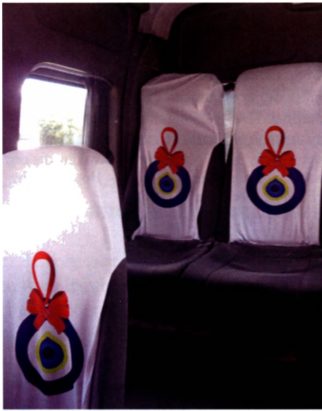
6. The nazar boncuğu symbol printed on textile protecting the bus. Marmaris, Turkey.