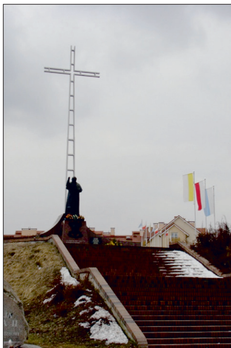
Figure 7. The statue of John Paul II in Gorzów Wielkopolski (2013)

What is more, papal memorials are the evidence that the symbol of the cross is very important to the Poles and it constitutes a distinctive feature of Polish cultural landscape. Statues of John Paul II are often accompanied with his pastoral cross or the cross itself is an element of the monument's construction, as in Gorzów Wielkopolski in western Poland (Fig. 7).