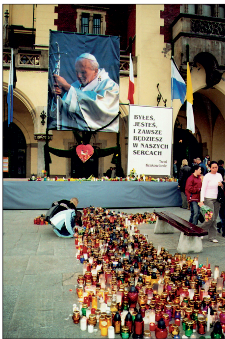
Figure 6. The memorable day of Pope's death in Kraków (2005)

Another kind of temporal 'John-Paul-the-Second-isation' takes place in spring. Although the biggest collection of candles, flowers, flags, pictures and prayers written on small pieces of paper was displayed at the beginning of April 2005 (Fig. 6), yet the anniversary of his death on 2nd April is still celebrated in that way in main squares in almost every Polish city or town.