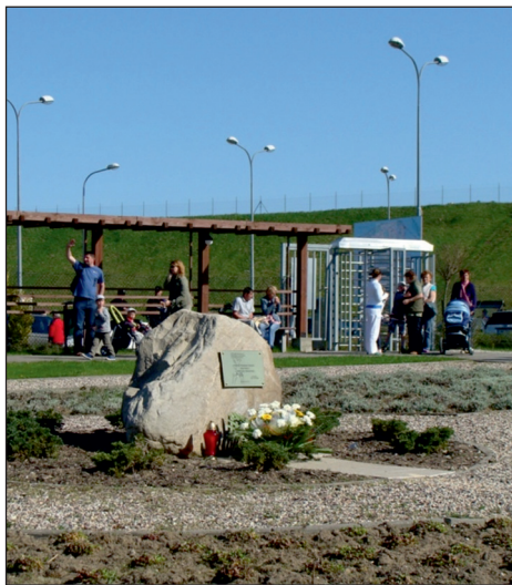
Figure 4. The plaque commemorating John Paul II in Gniewino (2012)

It should be emphasized that papal monuments and plaques are placed in prestigious places. For example, there is a plaque, mounted in 2011 to commemorate the beatification of John Paul II, located in front of the entrance to a new park with an observation tower in the village of Gniewino, neighboring a huge water power station in Żarnowiec in northern Poland (Fig. 4).