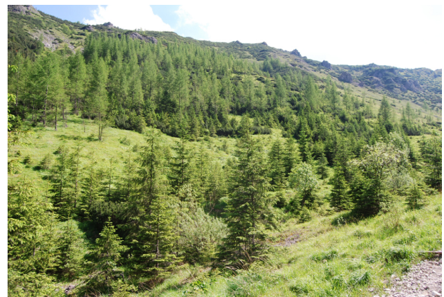
Figure 3. Present-day view of Jaworzynka Valley.

7.2°C). The valley's mean annual precipitation is 1661 mm (Błażejczyk et al., 2013).