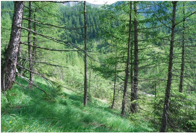
Figure 4. Open larch ( Larix sp.) forest with a dense cover of grass Calamagrostis sp. on the forest floor – plot no. 3.