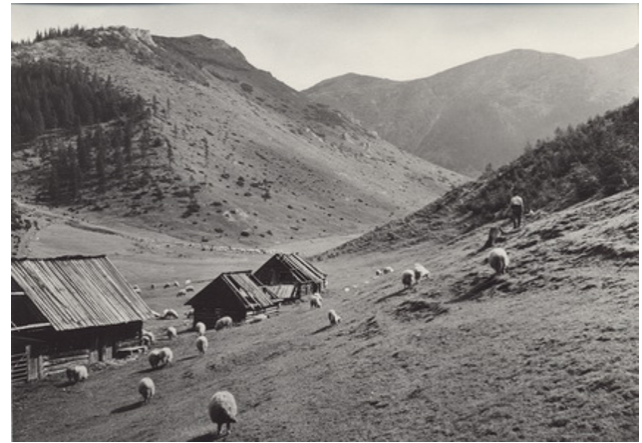
Figure 2. Sheep grazing in Jaworzynka Valley; shepherds' huts are visible (photo archive – Tatra Documentation Center, Tatra National Park, Zakopane, Poland).

The valley is made up of dolomitic limestone (Anisian, Ladinian) (Sokołowski and Jaczynowska, 1979). The mean annual air temperature in the study area (data for the nearest station: Hala Gasienicowa) is 2.4°C. The mean annual temperature of the warmest month (August) is 10.8°C (min. –4.1°C; max. 17.6°C). The mean annual temperature of the coldest month (February) is –5.3°C (min. –21.4°C; max.