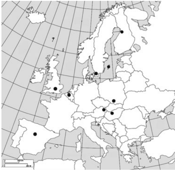
Fig. 1 Geographical distribution of sampling sites. (The map is used with permission of Cartographic Research Lab at the University of Alabama.)