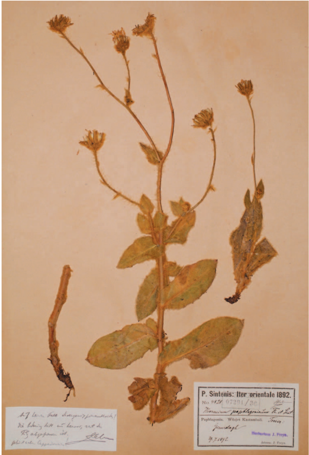
Fig. 17. Syntype of Hieracium paphlagonicum Freyn & Sint. (BRNM 7291/36).