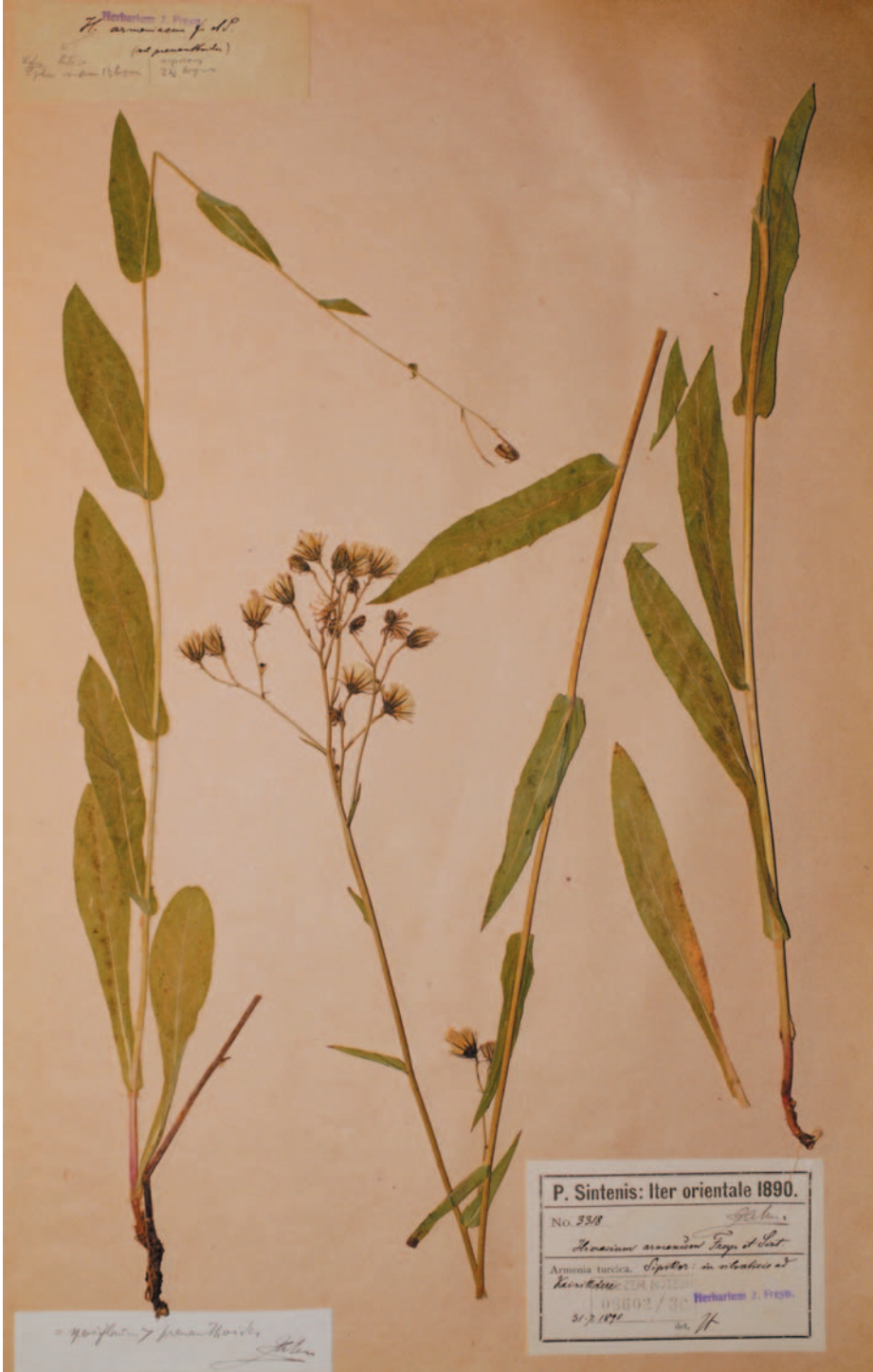
Fig. 1. Lectotype of Hieracium armenum Freyn & Sint. (BRNM 8602/36).