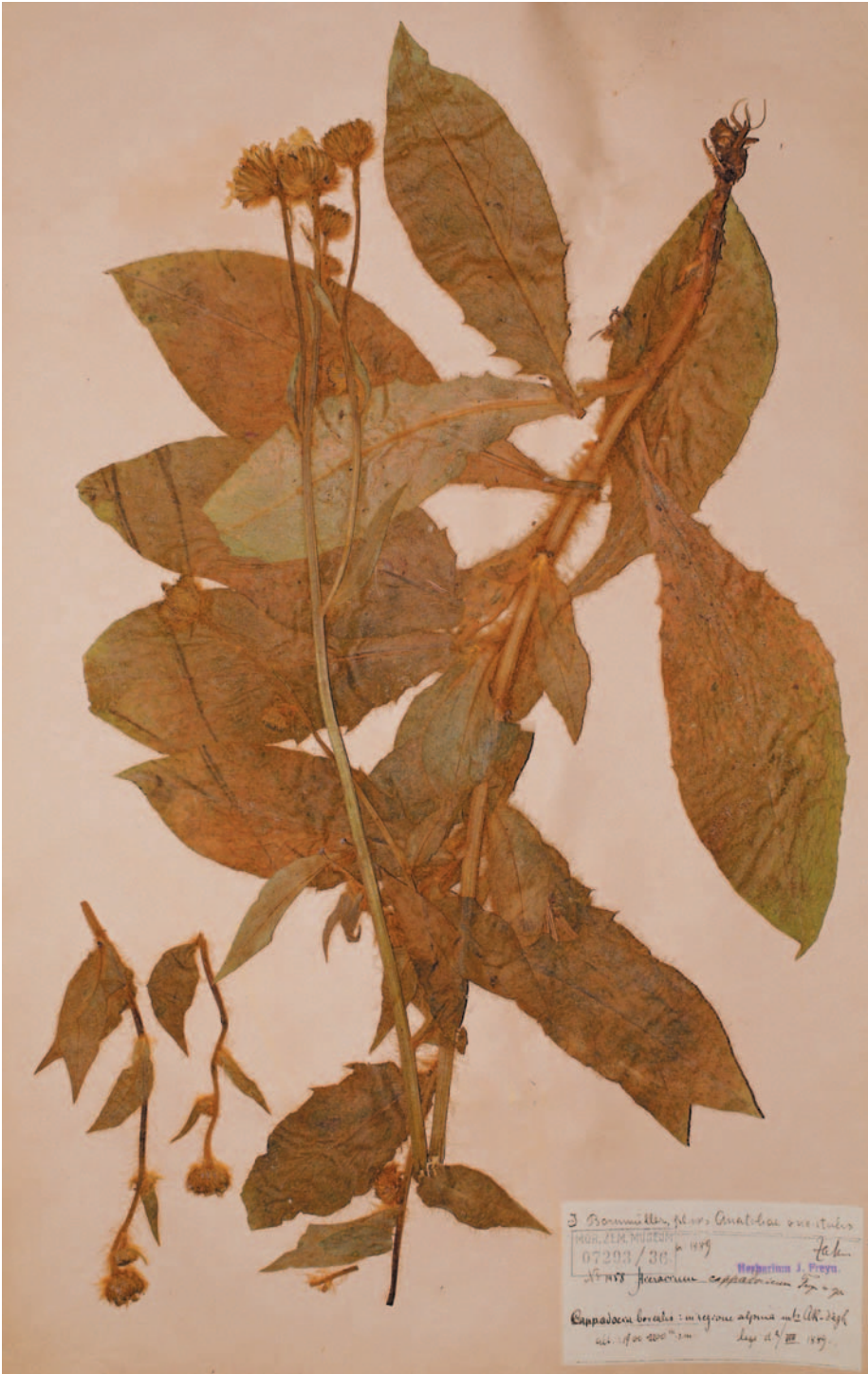
Fig. 6. Lectotype of Hieracium cappadicum Freyn (BRNM 7293/36).