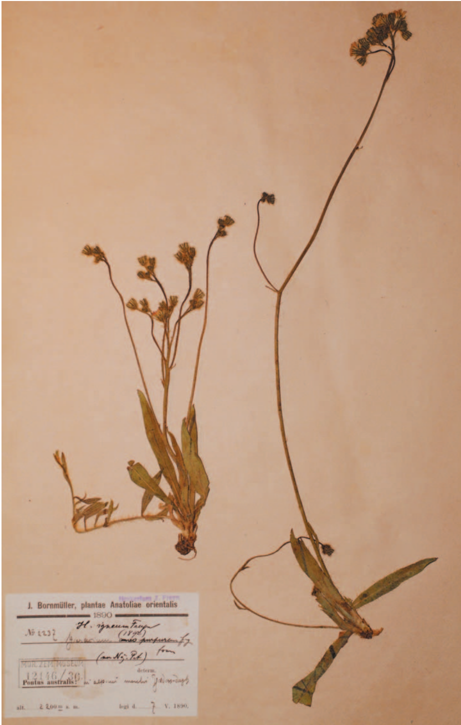
Fig. 3. Lectotype of Hieracium bauhini subsp. auropurpureoides Bornm. & Zahn (BRNM 12146/36).