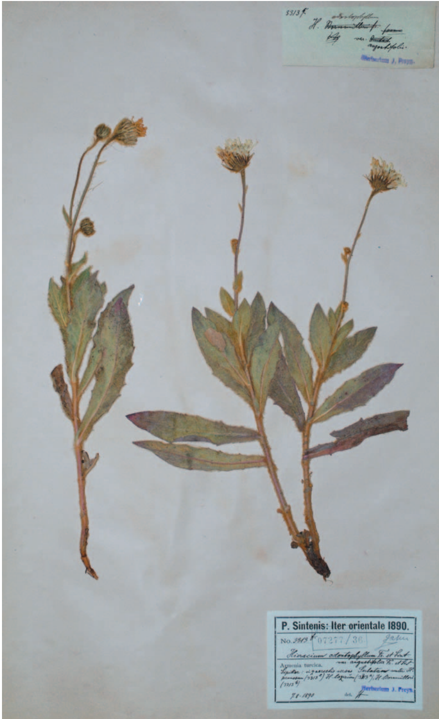
Fig. 16. Syntype of Hieracium odontophyllum Freyn & Sint. (BRNM 7277/36).