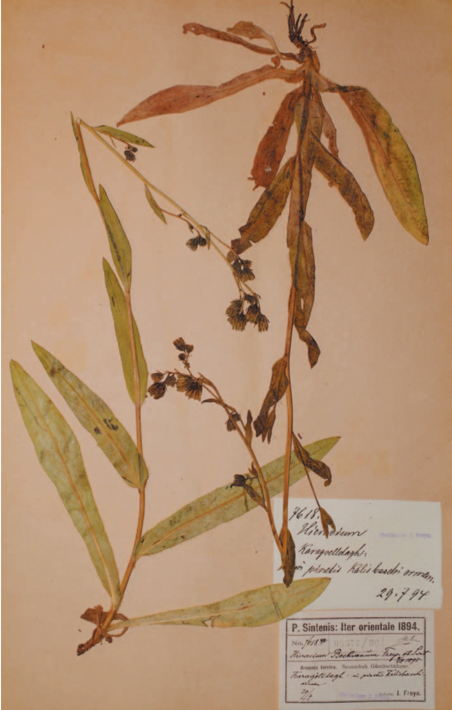
Fig. 15. Syntype of Hieracium mannagettae Freyn (BRNM 8577/36).