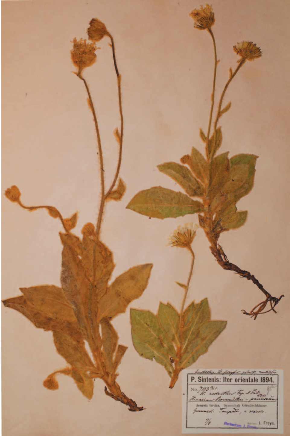
Fig. 19. Syntype of Hieracium reductum Freyn & Sint. (BRNM s.n.).