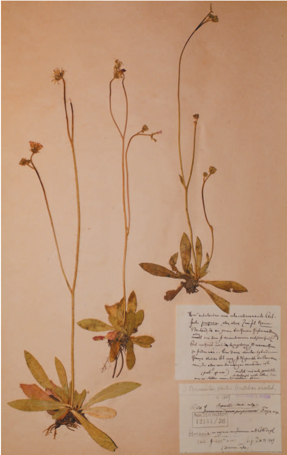
Fig. 2. Lectotype of Hieracium auropurpureum Freyn (BRNM 12144/36).