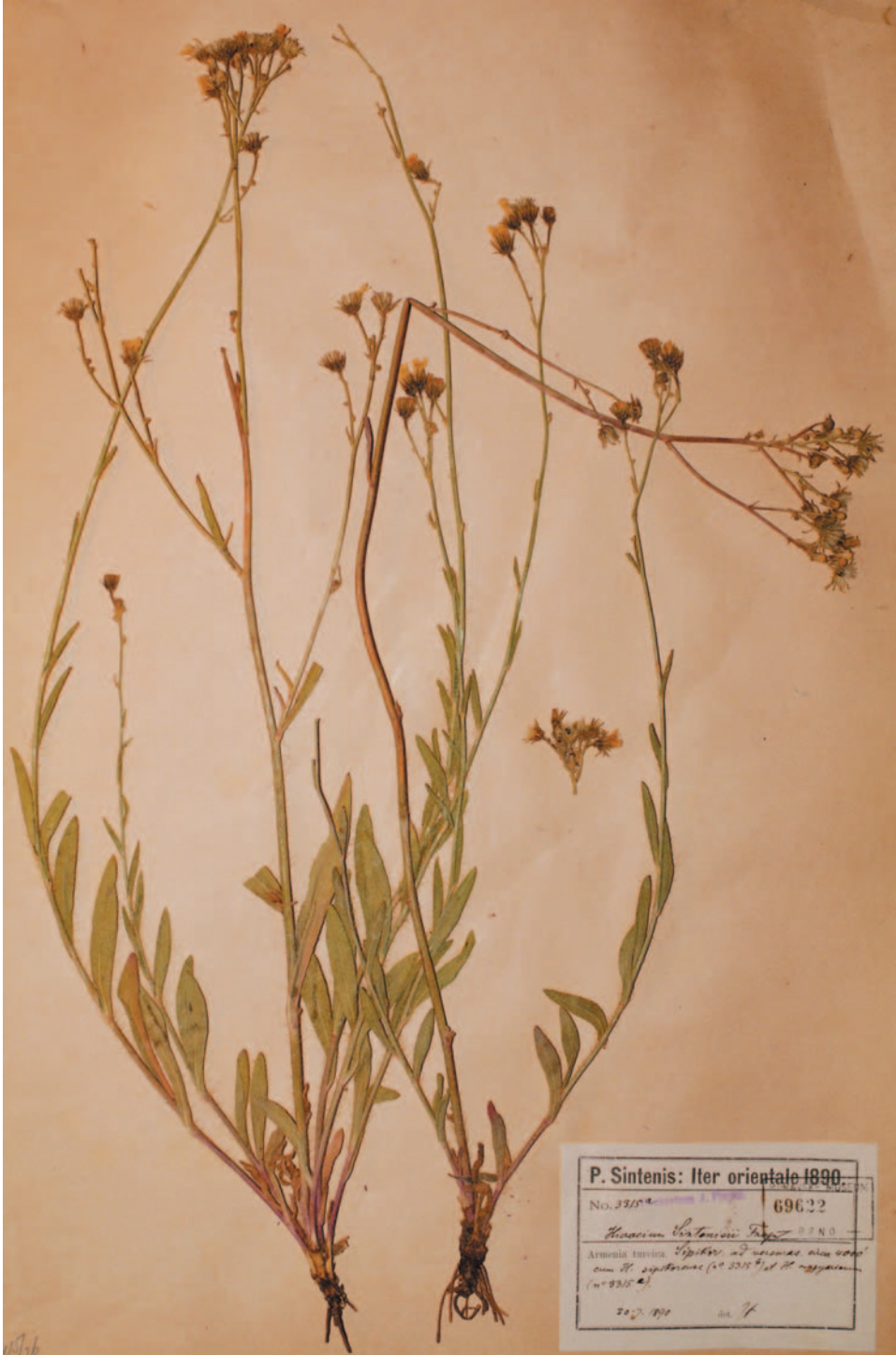
Fig. 20. Syntype of Hieracium sintensis Freyn (BRNM 69622).