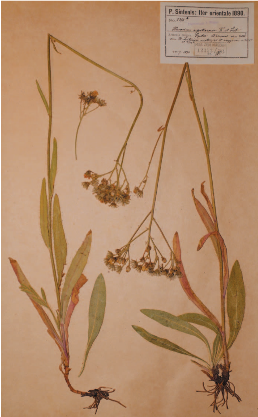
Fig. 12. Lectotype of Hieracium sipikorense Freyn & Sint. (BRNM 12353/36).