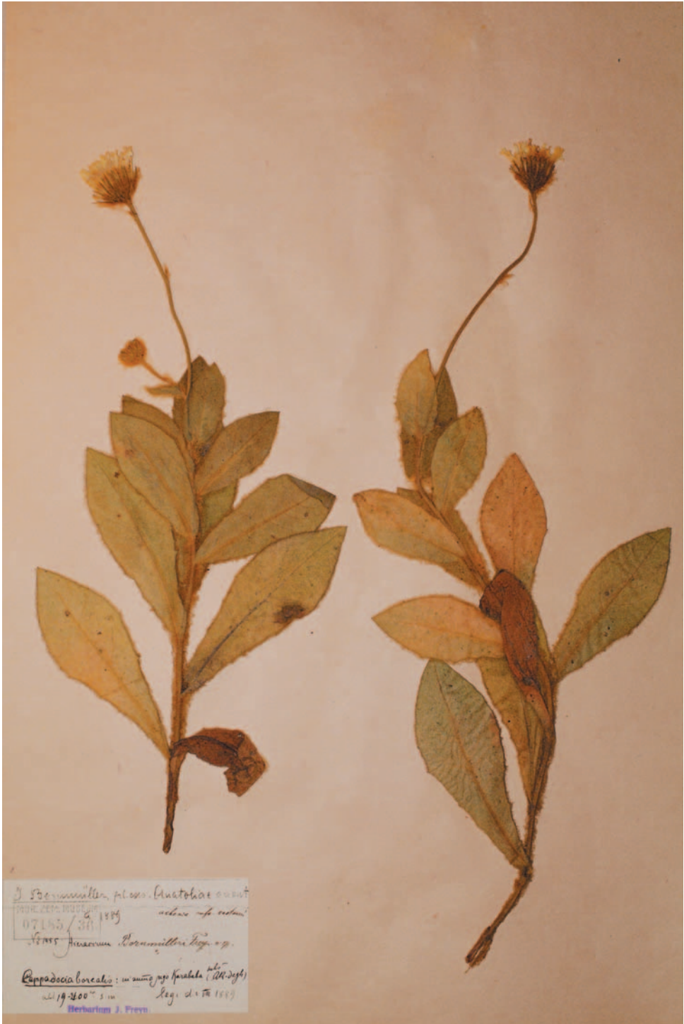
Fig. 4. Lectotype of Hieracium bormmuelleri Freyn (BRNM 7185/36).