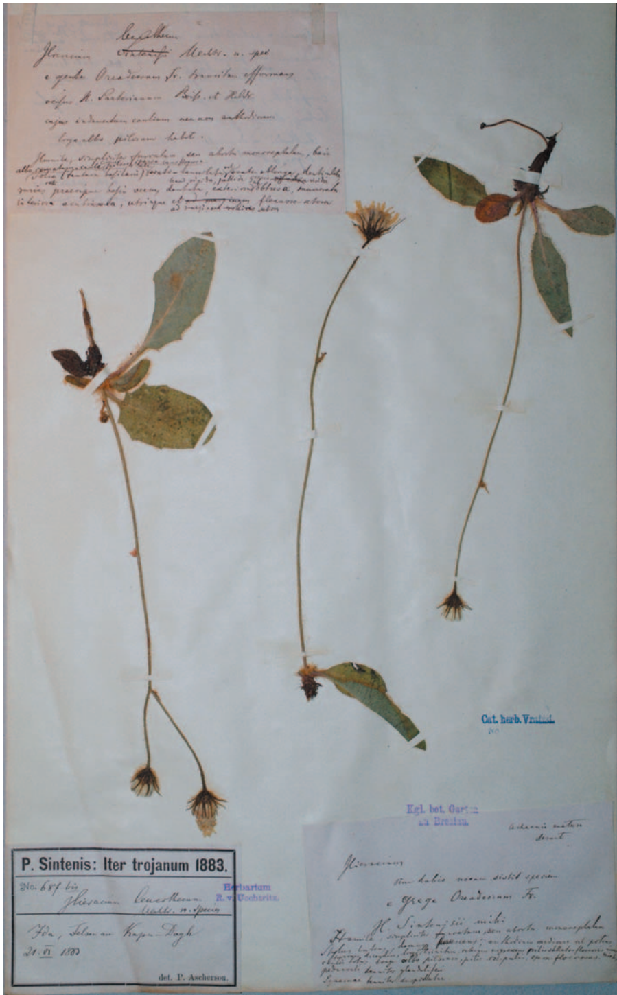
Fig. 8. Holotype of Hieracium leucothecum R. Uechtr. (WRSŁ s.n.).