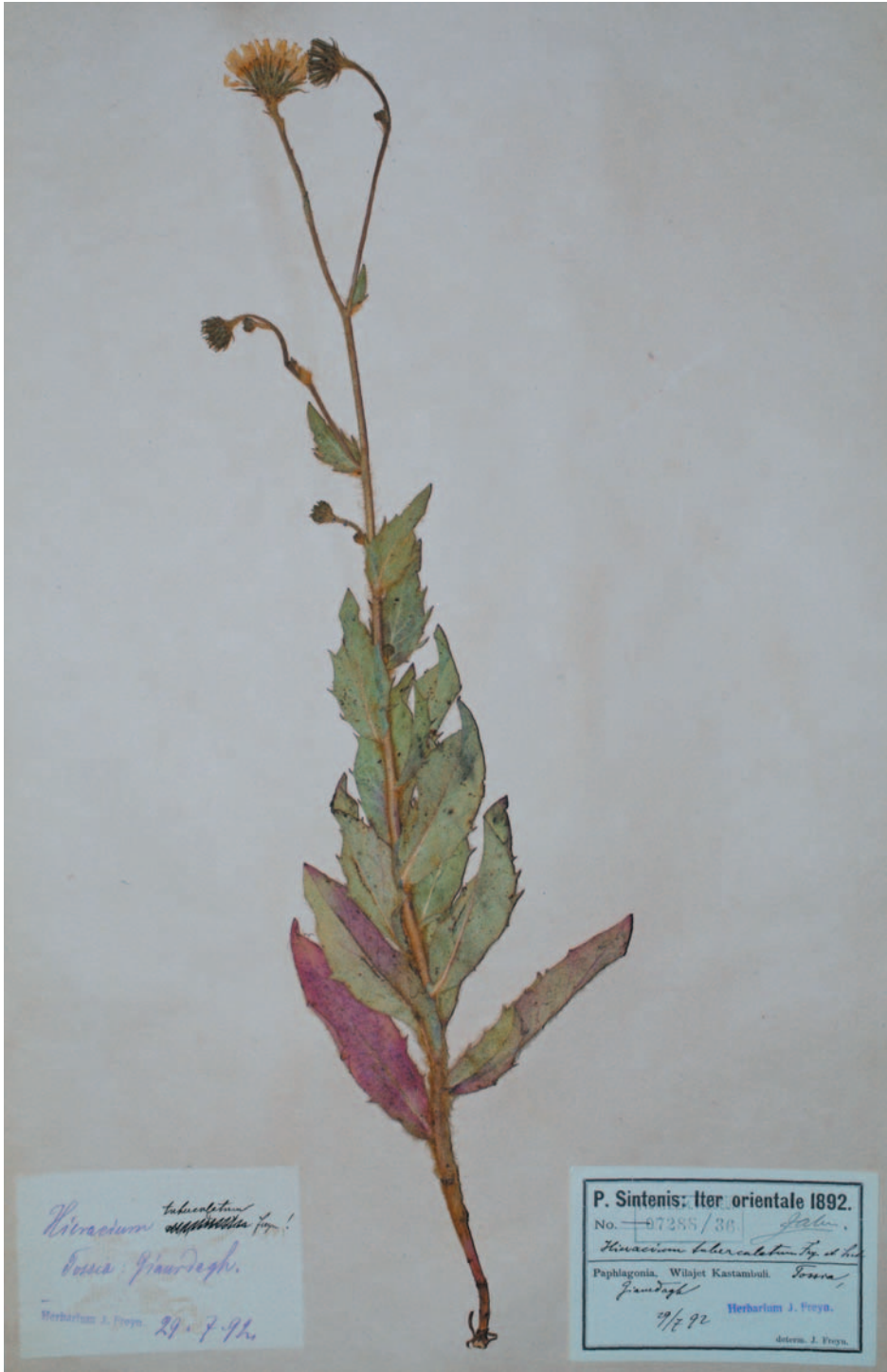
Fig. 14. Holotype of Hieracium tuberculatum Freyn & Sint. (BRNM 7288/36).