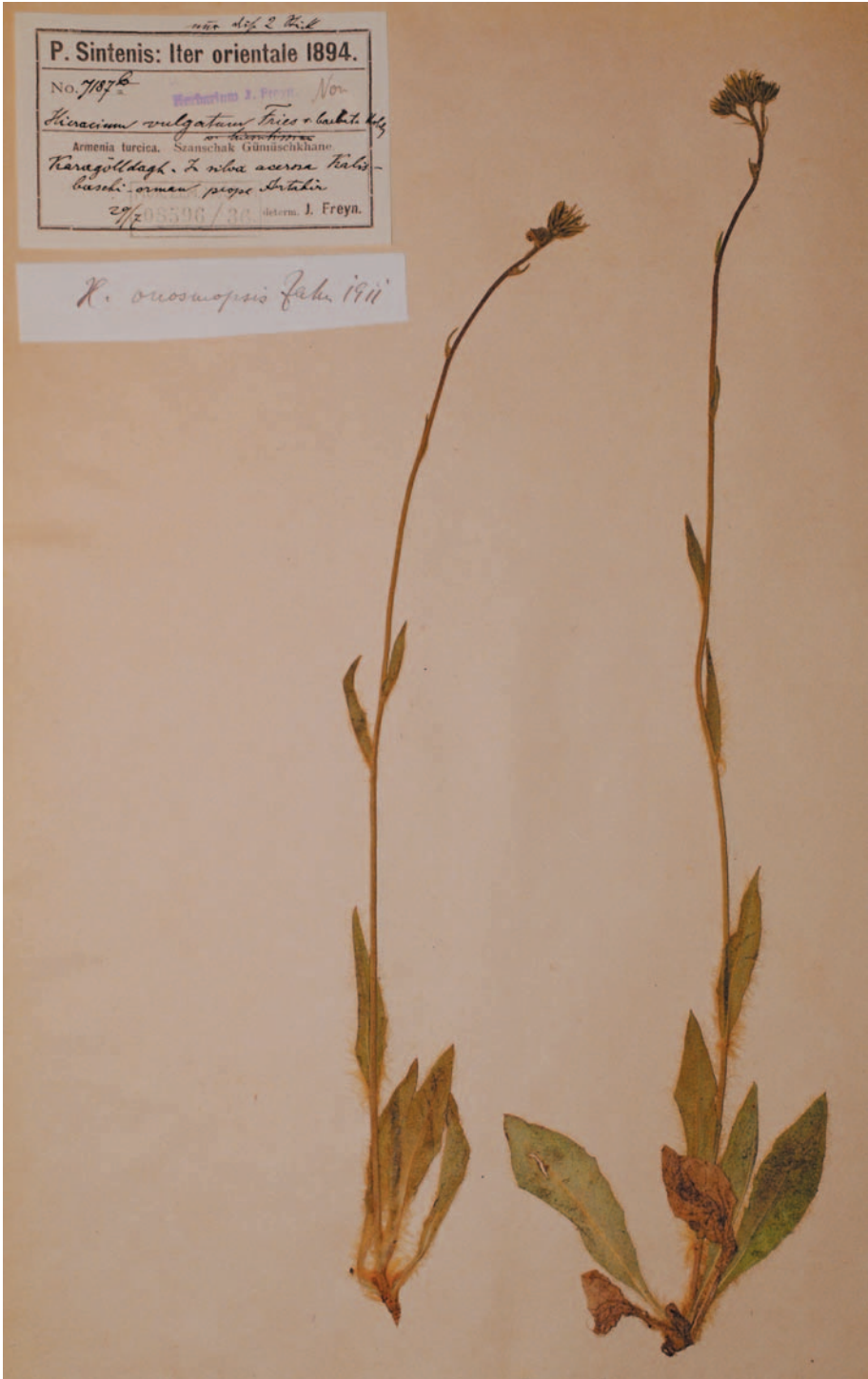
Fig. 5. Lectotype of Hieracium camkorijense subsp. onsmopsis Zahn (BRNM 8596/36).