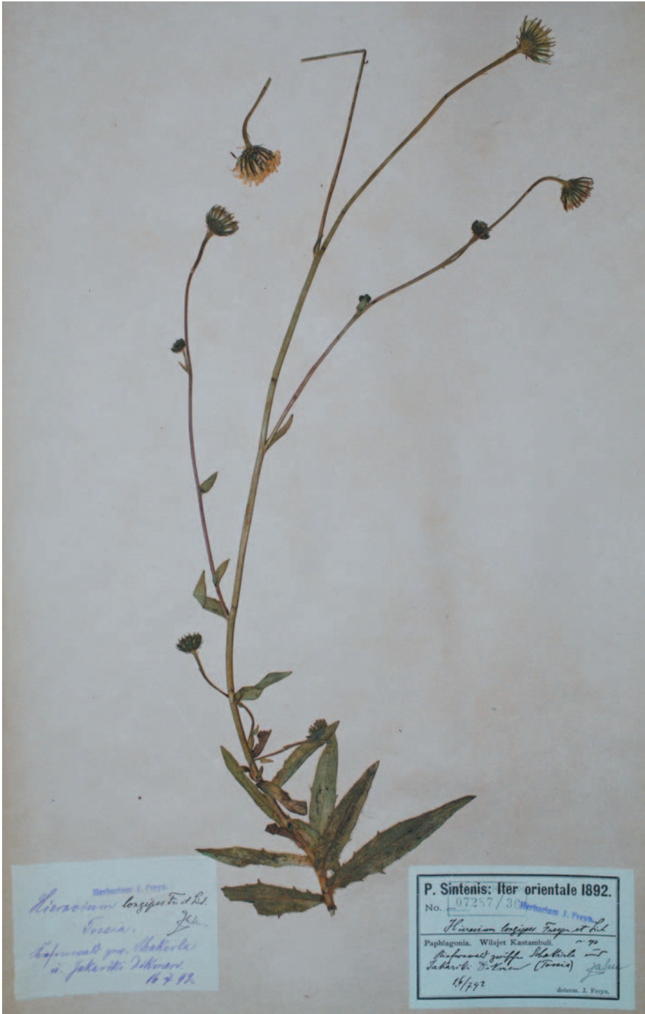
Fig. 11. Lectotype of Hieracium praelongipes Zahn (BRNM 7287/36).