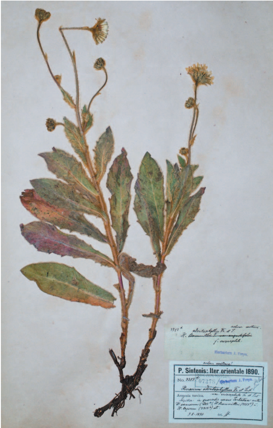
Fig. 9. Lectotype of Hieracium odontophyllum var. eriocephalum Freyn & Sint. (BRNM 7278/36).