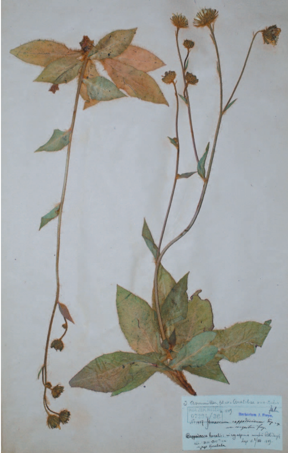
Fig. 7. Lectotype of Hieracium cappadocicum var. congestum Freyn (BRNM 7294/36).