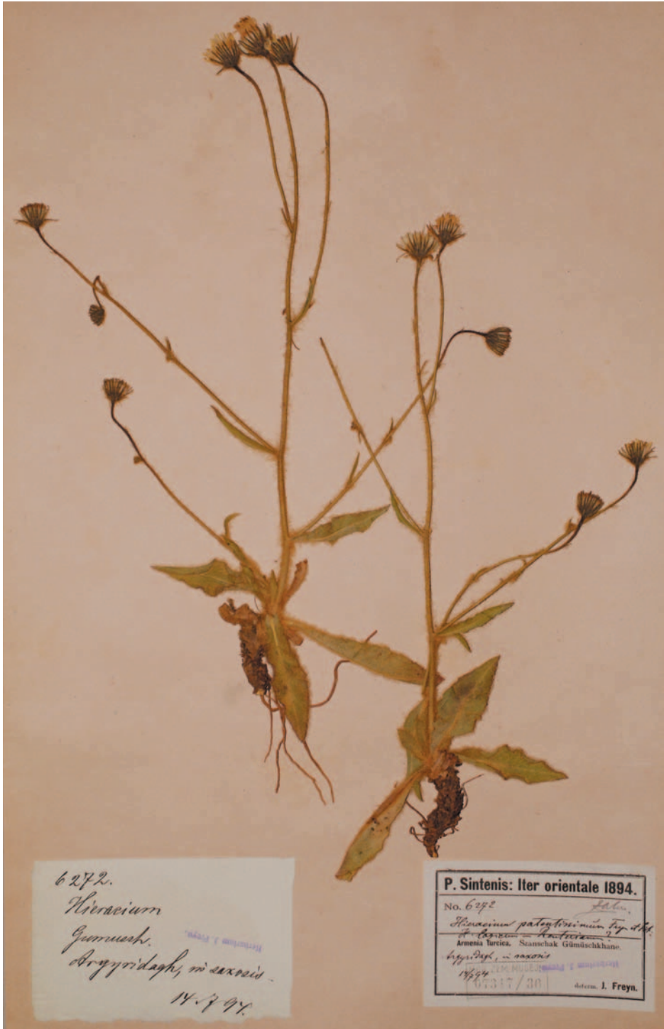
Fig. 18. Syntype of Hieracium patentissimum Freyn & Sint. (BRNM 7317/36).