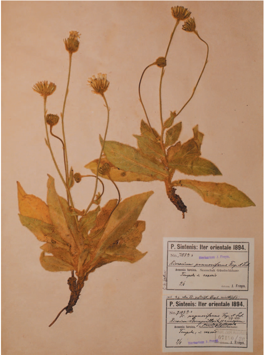
Fig. 10. Lectotype of Hieracium pannosiforme Freyn & Sint. (BRNM 7180/36).