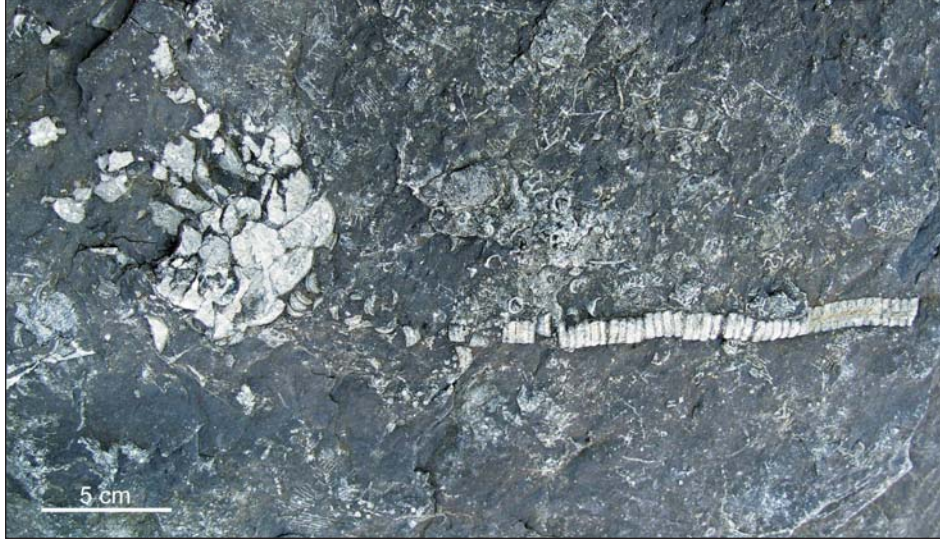
Fig. 3. Catacrinidae gen. et sp. indet. Posterior view of a slightly distorted specimen. ZPAL Ca. 9/A.1.

Description. — Cup low and bowl-shaped with a single, large, hexagonal anal. Basals trapezoid-shaped, convex, widely outflaring. Radials pentagonal, convex, outflaring. Proximal arms biserial, isotomously branching above two? uniserial and poorly visible primibrachials. Distal arms not preserved. Brachials chisel-shaped, round transversely. The homeomorphic and non-cirriforous stem composed of low columnals with convex latus. The articular facet flat and covered with numerous fine culmina. The lumen rather small, circular.