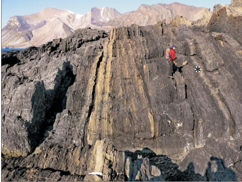
Fig. 2. Steeply dipping beds in the lower part of the Kapp Starostin Formation in the northern part of Akseløya. The catacrinid crinoid was collected in the horizon in front of the person (asterisk).