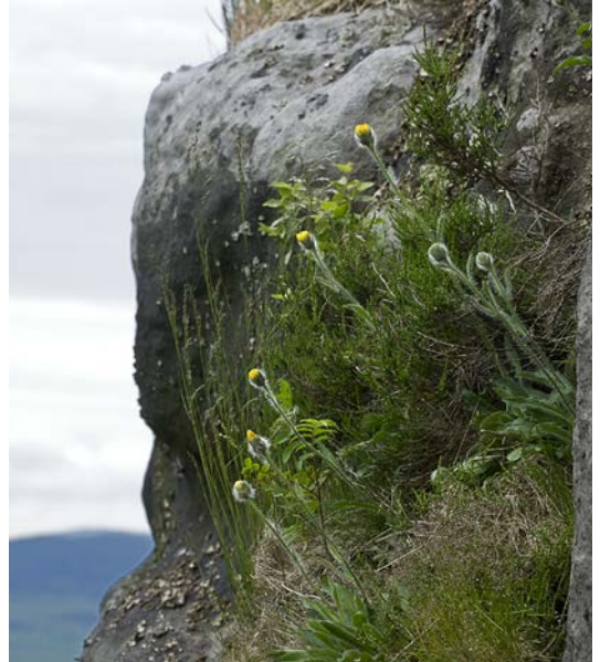
Fig. 2. Flowering Hieracium sudetotubulosum Szelağ on Mt. Szczeliniec Wielki.

(Zahn 1938), and by Zlatník (1938, 1939). A new taxonomic revision of Hieracium sect. Alpina (Griseb.) Gremlí in the Sudetes was made by Chrtek (1995, 1997). A summation of all these studies was published in Květena České Republiky (Chrtek 2004).