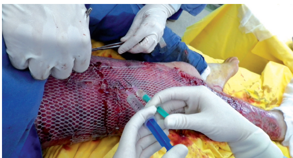
Figure 2. The application of the meshed split thickness skin graft and cultured autologous keratinocytes to a III degree flame burn wound of the lower limb

Such a procedure reduces the healing time significantly. On the other hand, the use of cultured cells only (CAC) is associated with a non-significant delay in healing, which emphasizes the role of this technique in patients with limited donor sites, especially among chil-