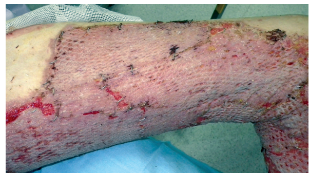
Figure 3. The condition 8 days later – the healing process completed