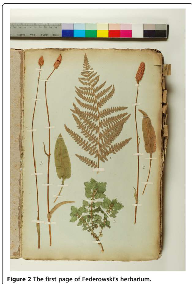
Figure 2 The first page of Federowski's herbarium.