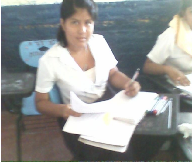
Student copy of the blackboard her Homework.