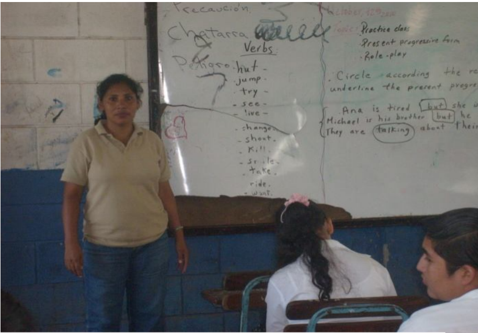
➤ Teacher explaining the class.