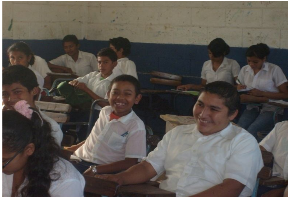
➤ Students in the classroom.