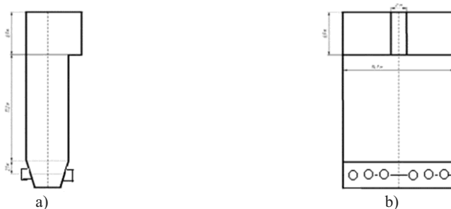
Fig. 1. Sketch of the furnace: a) longitudinal section; b) cross section.

approaches: Eulerian–Eulerian and Eulerian–Lagrangian models. In the Eulerian–Eulerian model, the solid phase is treated as a continuum, and an Eulerian framework is applied to describe the motion of the solids [4]. In most recent Eulerian–Eulerian model constitutive equations according to the kinetic theory of granular flow are incorporated [4-6]. Though physical characteristic of the solid particles such as the shape and size are included in the continuum representation through the empirical relations for the interfacial friction, these models do not recognize the discrete character of the solid phase [3].