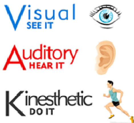
Fig.1. Learning styles

These styles are overlaid with a person’s preference for learning is a social or solitary environment and how they absorb and process the information through reflection or other options to create a complex web of possibilities: