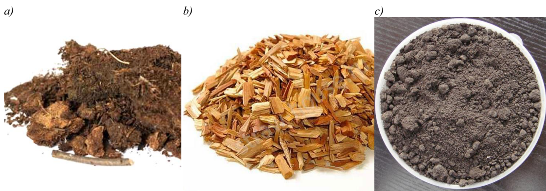
Figure 1. Biomass of the Tomsk region (Russian Federation): a) peat of the Kandinsky deposit; b) waste wood; c) lake sapropel of the Karasevskoye deposit

The following types of the Tomsk region biomass were investigated (Fig. 1): the Kandinsky peat, waste wood, Karasevskoye lake sapropel.