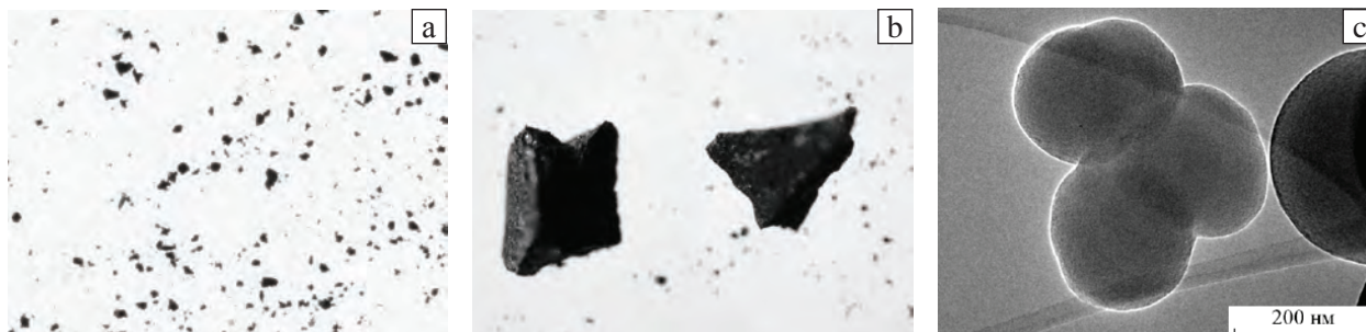
Fig. 1. Shape of dispersed particles of CWS: a – carbon powder, b – carbon particles, c – carbon globules

The curves of dynamic viscosity (viscometer Reotest-2) are similar to a non-Newtonian fluid's curves (Figure 3). They are approximated by pow-