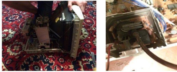
Fig. 1a,b .The removal of the transformer