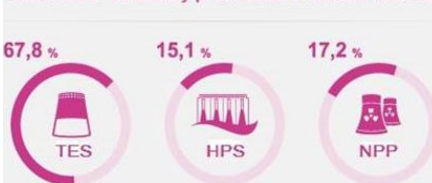
Structure of electricity production in Russia in 2013

15 days ( until their absence), lead to a restructuring of the unique floodplain ecosystems across the river stream, as a result, pollution of rivers, reducing the trophic chain, reducing the number of fish, aquatic invertebrates elimina-