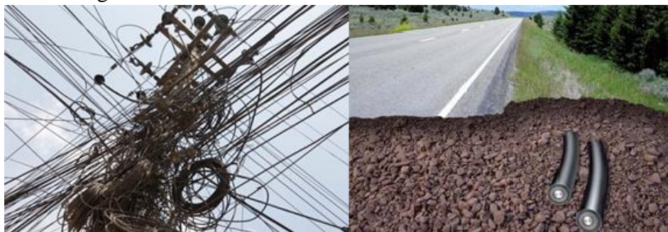
Figure 1 (left) – Before and after laying underground cables.

Underground cables are part of the electric transmission system designed for underground installation. Their main purpose is the transmission of electrical energy. Undergrounding refers to the replacement of overhead cables providing electrical power or telecommunications, with underground cables. This is typically performed for aesthetic purposes. In figure 1 below one can see how cables can improve the visual impact to people and surroundings.