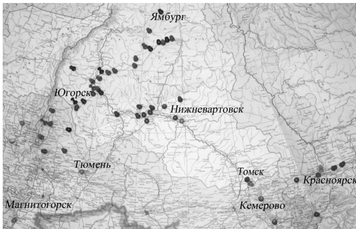
Fig. 1. The map of introductions of the LIS/ LIMS «Chemist – analyst» in Ural-Siberian region

The basis of methodology of development of the LIS/ LIMS «Chemist – analyst» is laid on the principle, which essence consists in reflecting of work of a laboratory through such habitual concepts as laboratory logs and intralaboratory functions of laboratory in view of requirements of home normative documents. According to it electronic laboratory logs, which depth of study of measurement results taking into account a history of reception of parallel definitions and metrological maintenance of resulting value, completely meets any requirements of various techniques are included in the LIS/ LIMS «Chemist – analyst». The requirements of home normative documents concerning conditions of realization of the intralaboratory control – definitions