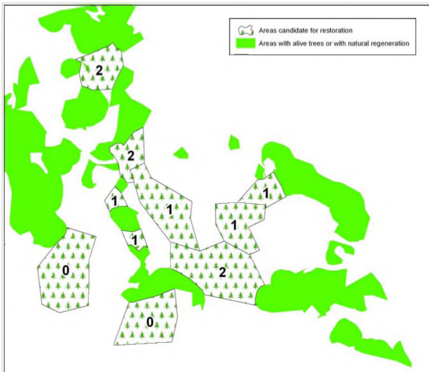
Figure 1. Prospective areas for restoration ranked on the basis of their contribution to the re-establishment of forest connectivity {0: no contribution, 1: medium (link patch), 2: high (intersection node)}.