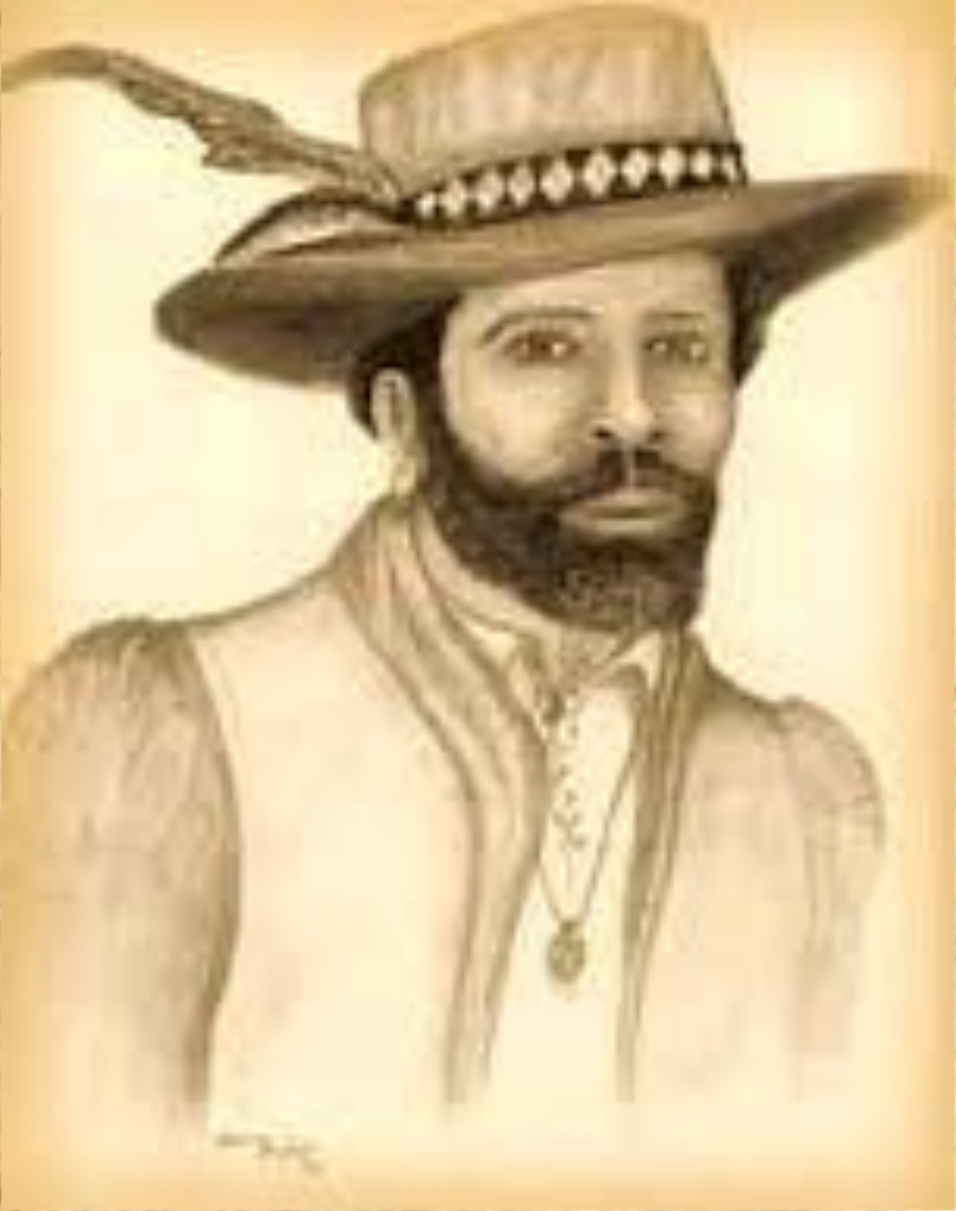
(i) ARTIST'S RENDITION

HAS BEEN SEEN IN THE FOLLOWING JURISDICTIONS