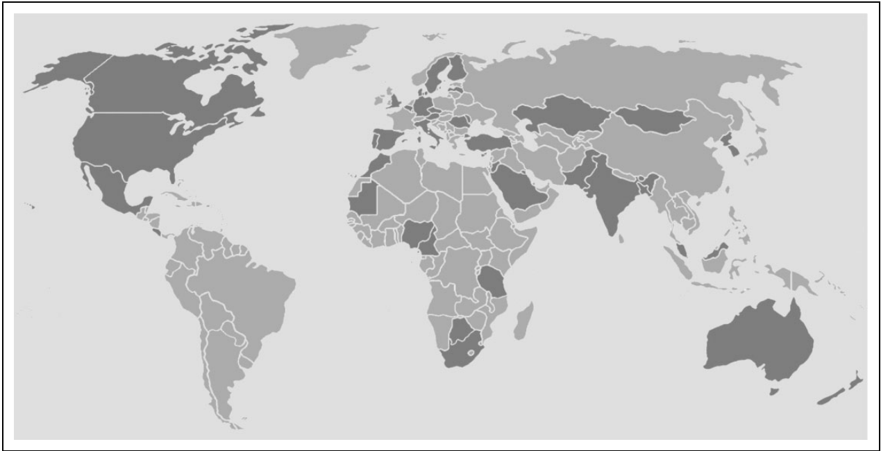
Figure 3. Worldwide Locations of Authors

think, been over-advocated, considering that the academic domain as a whole still does not have sophisticated methodological foundations and has been called ‘methodologically limited’ (Bulfin et al., 2014: 403; Schön and Ebner, 2013). Moreover, believe 35% of the authors, E&T findings are presented without rigorous evaluation, and/or their positive effect on learning is insufficiently verified or proved. And this perceived excessive use of technology in education does not necessarily help with learning but rather may result in negative cognitive and/or sociological consequences. The writings of Cifuentes et al. (2011), Spitzer (2012), Tondeur et al. (2013) and Ertmer et al. (2014) constitute a valuable reading list in this regard.