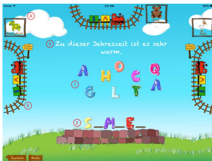
Figura 4. Pantalla principal de Buchstaben Post - pregunta (3) y letras (1) además de la solución (2)

like “you will find it in winter and it is white”. The child is provided also with a number of letters. The given letters are usually not the one the child would need to solve the question. So the child has to ask the other players whether they have the required letters or not. The players can send her the missing letters just by swiping the letter to her iPad. The next round can be started after each child has solved her small puzzle. This application is a so called collaborative app. The pupils are supposed to work with and talk to each other while using the app. Specially they have to help each other to spell a word. Buchstaben Post provides also a web-based administration platform. The teachers can create an individual set of questions/words pairs for their classes on the administration platform.