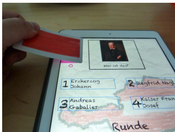
Figura 5. El jugador rojo introduce la respuesta correcta

provided with four plastic cards one for each corresponding answer. In this way it is possible to hide the answer from the other players.