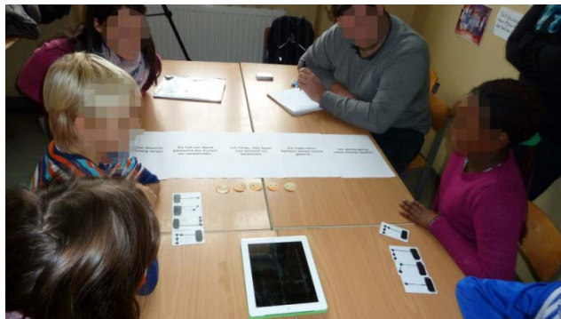
Figure 1. Children being interviewed, assisted by cut-off technique

arguments of the children about their experiences with the used applications. It can be stated that with the help of the cut-off technique children did not feel observed and answered in a very un-stressful way.