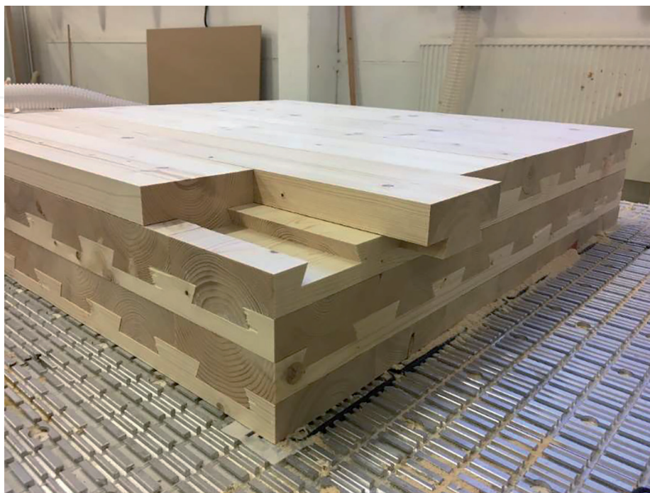
Figure 5. Test specimen of adhesive- and metal fastener-free dovetail wood board element.

Overall, this chapter examines massive wood construction in Finland from past, present, and future perspectives. It is thought that this study will assist and guide key professionals in the design and implementation of timber buildings in Finland.