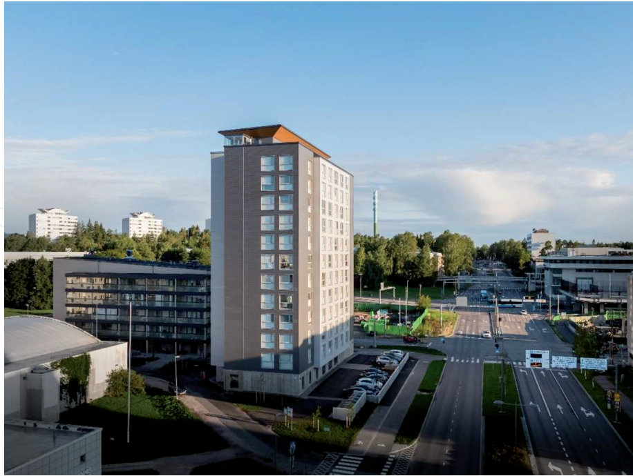
Figure 4. HOAS Tuuliniitty (photo by Miika Ullakko, courtesy of Arkkitehti toimisto Jukka Turti ainen/Arkkitehti palvelu Oy).

institutions, organizations, and regulations in Finland [20–28]. As a result, the search and trend towards innovative and “green” wood products such as adhesive- and metal fastener-free dovetail wood board elements ( Figure 5 ) seem to shape the future of the Finnish construction industry [29, 30].