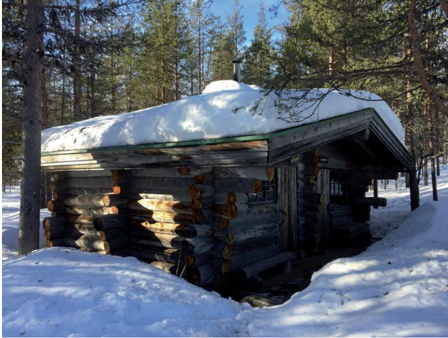
Figure 1. Log cottage example from Finland.