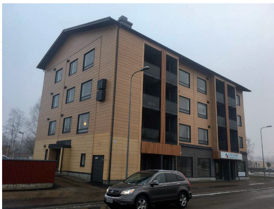
Figure 7. A four-story log apartment, Finland.

Finland has the second-highest proportion of multi-story buildings in Europe after Spain, and about 47% of Finnish housing units are located in multi-story buildings [41]. However, the market share of timber multi-story apartments constructed was only 1% in 2010, and the share increased to 10% by 2015 [42]. By March of 2022, 130 two-story timber apartment buildings have been built in Finland, a total of 4150 apartments [43, 44].