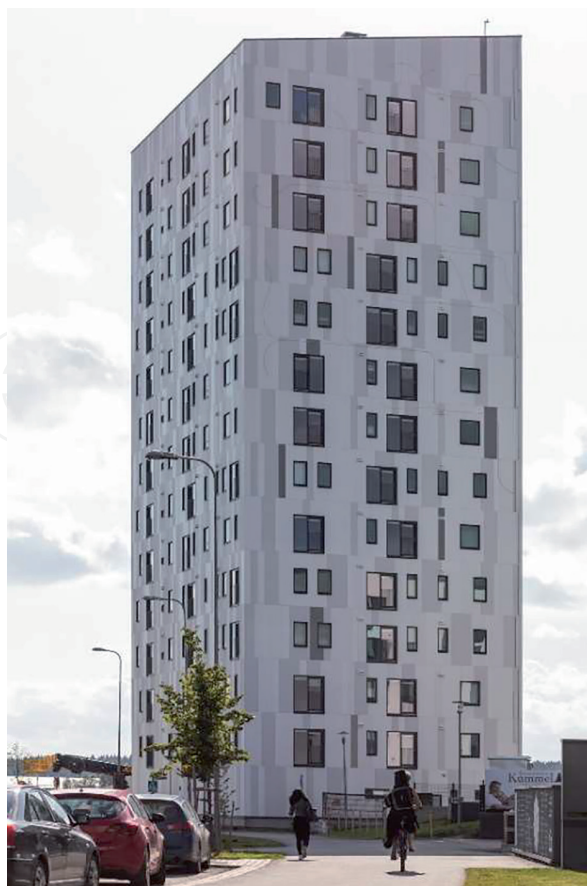
Figure 3. Lighthouse Joensuu.

In line with “Finnish National Energy and Climate Strategy” [18] and “Guidelines on State Aid for Climate, Environmental Protection and Energy 2022” [19], as a reflection of environmentally friendly approaches to reduce greenhouse gas emissions and carbon footprint on the construction industry, the use of wood has become more prevalent, especially by being encouraged by many government-supported