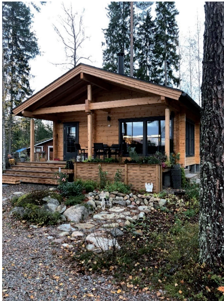
Figure 2. A modern log cottage example from Finland.