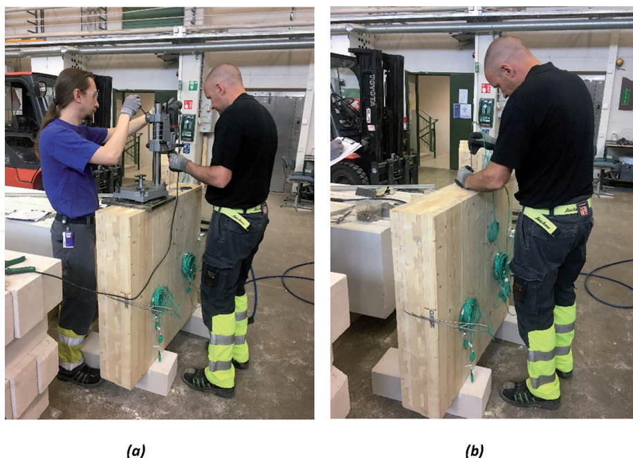
Figure 10. Preparation of dovetail specimens for fire resistance test at Tampere University Fire Laboratory, Tampere, Finland. (a) Drilling and (b) thermocouple insertion.

Overall, the global economy engine naturally shifted the focus of Finnish construction technology to viable solutions, which means that concrete's low return on value hinders the use of one of the defining features of Finland's global image—the vast forest resources are not fully utilized internally as they should be. In this sense, because of environmental considerations, there is a rising interest in the use of timber and the advancement of wooden structural elements. This has led to a wide variety of EWPs used in advanced ways to replace conventional construction materials, for example, steel and reinforced concrete, and enhance the appeal of wood construction, thus leading to the quest for groundbreaking and environmentally friendly EWP solutions (e.g., dovetail massive wood board elements) ( Figure 10 ) for the future of timber in Finland. Currently, although the uptake of for example dovetail massive wood board elements for industrial applications is very limited, with new projects to be developed, it can be used more in the construction of multi-story and even tall buildings. In order to contribute to environmentally friendly construction and low embodied energy and carbon buildings, more research is needed to develop innovative and sustainable EWPs that are nontoxic, low-cost, recyclable with well-designed structural features and life cycle assessments.