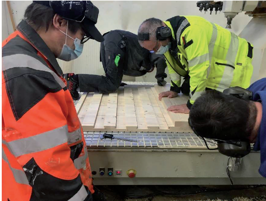
Figure 9. Manufacture of dovetail massive wood board element at Vocational College Lapland (Ammattiopisto Lappia), Kemi, Finland.

concept, the future of wooden construction can be shown as hybrid buildings, where other materials are used together and benefit most, either structural members (such as wood and steel or concrete combinations) or cross-section-based level (such as wood and plastic) [63]. As in the cases of the 25-story and 87 m high Ascent (Milwaukee, under construction), the 24-story and 84 m high HoHo (Vienna, 2020), and the 18-story and 58 m high Brock Commons Tallwood House (Vancouver, 2017), hybridization using a reinforced concrete core target better structural safety and performance, which becomes more and more important with increasing building height.