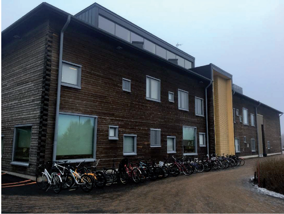
Figure 8. Pudasjärvi log school campus, Finland (photo by Hüseyin Emre Ilgin).

The American platform-frame system, based on floor-by-floor stud frame construction, was mostly used for the construction of Finland's earliest residential buildings. Nowadays, in Finland, timber apartments are executed with three different structural solutions: a volumetric modular system, a load-bearing large element system, and a post-beam system, and among them, the most popular way of building wooden apartments is to use of volumetric modular element designs based on CLT [45]. On the other hand, these elements can also be applied as a rigid structure. Furthermore, timber-concrete composite board structures are primarily utilized on the intermediate floors due to their advantage in sound insulation.