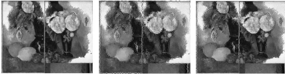
Figure 4. a) Work-of-art original image 512×640, b) Ciphared image for C = 128, c)

Selective encryption (SE) is a method that encodes only the most important portion of the data in order to provide a proportional privacy and to reduce computational requirements. The objective of our work is to leave free the low-resolution image and give full-resolution access only for authorized person. This approach is based on AES stream ciphering using VLC (Variable Length Coding) of the Huffman's vector. The proposed scheme allows decryption of a specific region of the image and results in a significant reduction in encrypting and decrypting processing time. It also provides a constant bit rate and keeps the JPEG bit-stream compliance (figure 4).