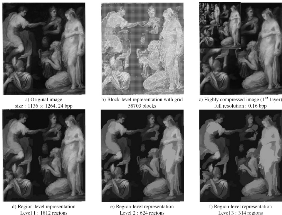
Figure 2. Low resolution LAR image and hierarchical region representation on “CRT” with partition QP[16...2] and N_0 < 2

The LAR method has been initially introduced for lossy image coding [6]. It is based on the assumption that an image can be represented as layers of basic information and local texture. Thus, the overall scheme of this approach consists of two scalable layers: a first one to encode an image at low bit rates, and a second one for visual quality enhancement at medium/high bit rates.