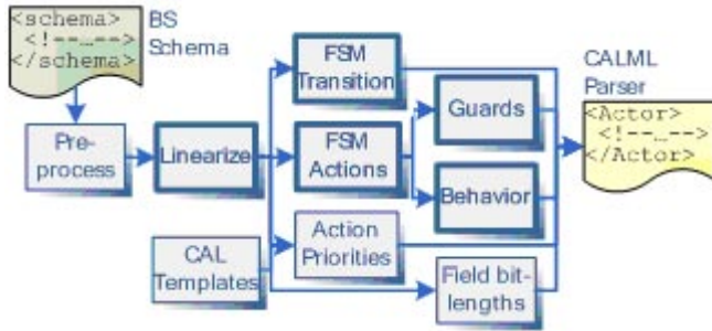
Fig. 7. The XSLT transformation process